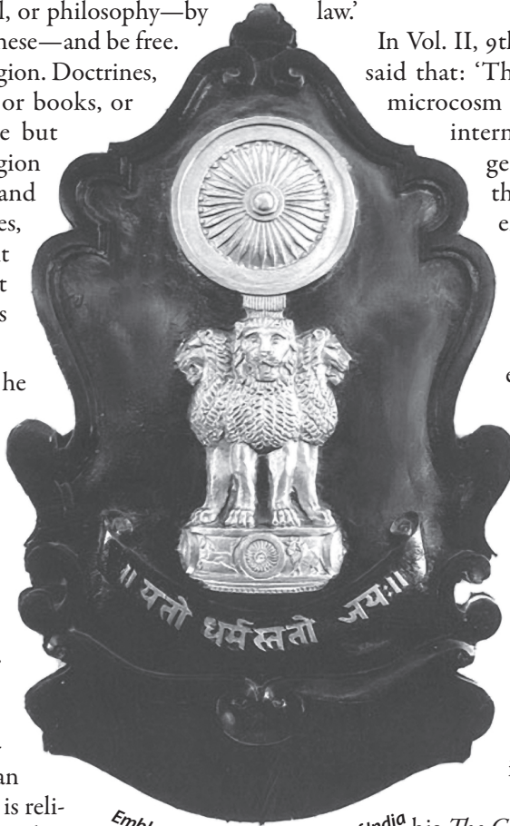
Emblem of the Supreme Court of India

Swami Vivekananda in his The Complete Works , Vol.1, 11th Edn. at p. 366 said that: 'The foundations have all been undermined; and the modern man, whatever he may say in public, knows in the privacy of his heart that he can no more "believe", ... believing because it is written in certain books, believing because [his] people like him to believe, the modern man knows it to be impossible for him. There are, of course, a number of people who seem to acquiesce in the so-called popular faith but we also know for certain that they do not think. Their idea of belief may be better translated as "non-thinking