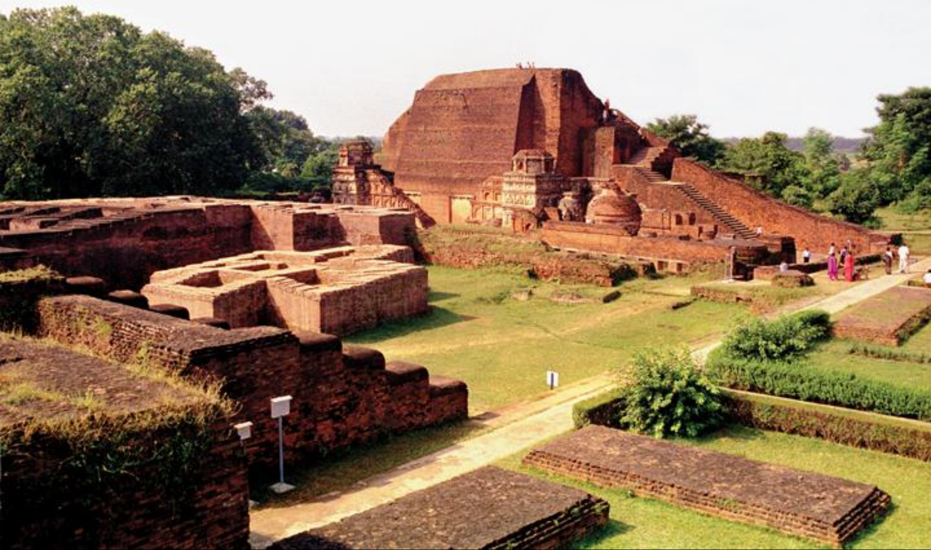
The Nalanda University site, Bihar, India.