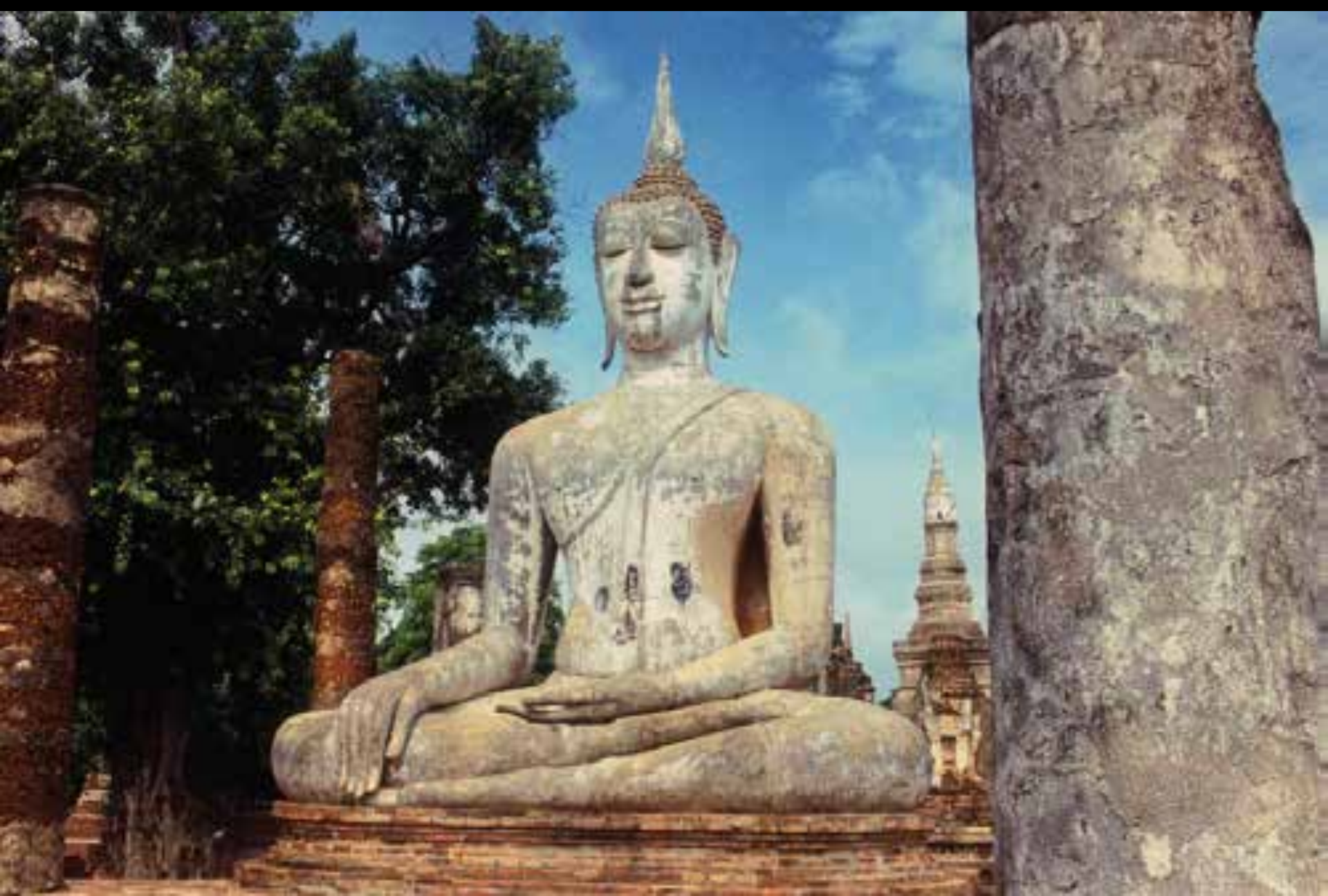
Seated Buddha, Wat Maha That, Sukhothai Historical Park, 13 th -14 th centuries, Thailand.