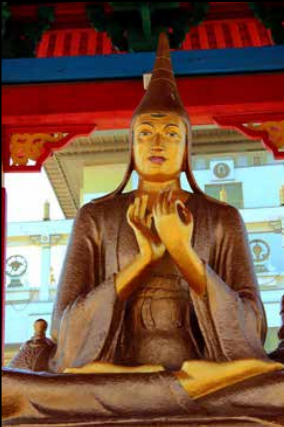
Atisa, Golden Abode of Shakiyamuni Temple, Elista, Kalmykia, Russia.