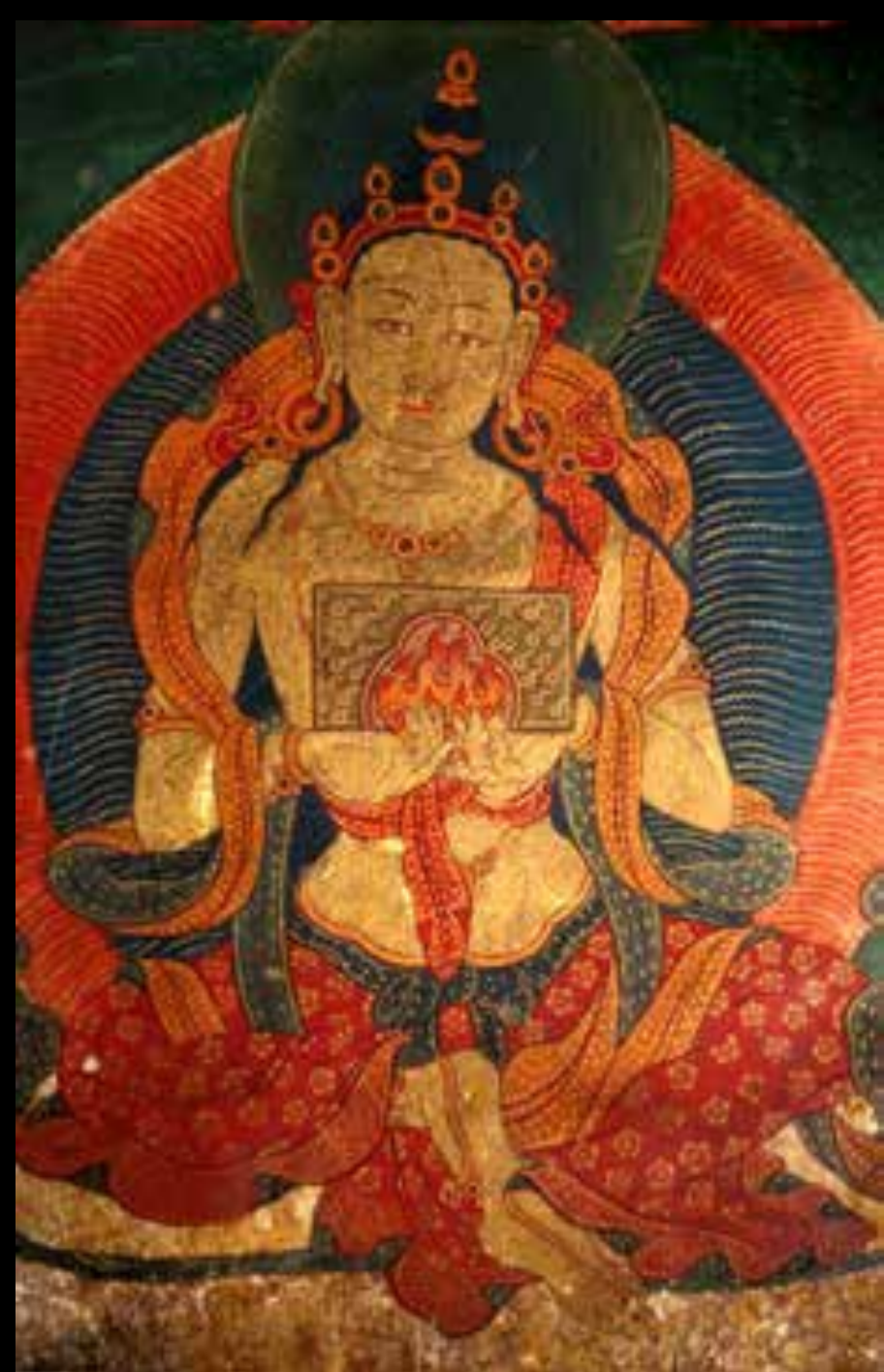
Mural, Kurjey Monastery, Bumthang, Bhutan.