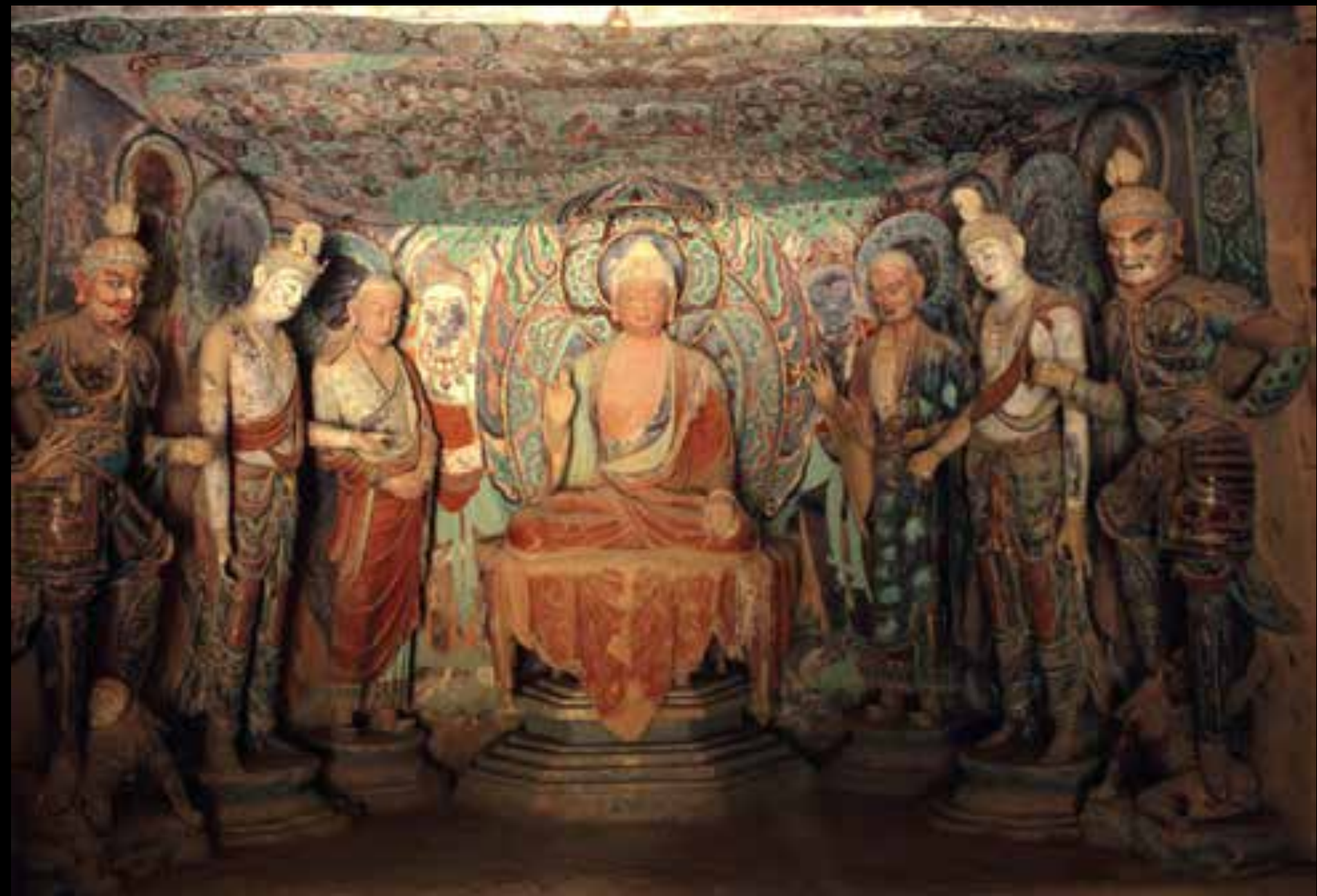
Interior of Mogao Cave no. 45, Dunhuang, China.