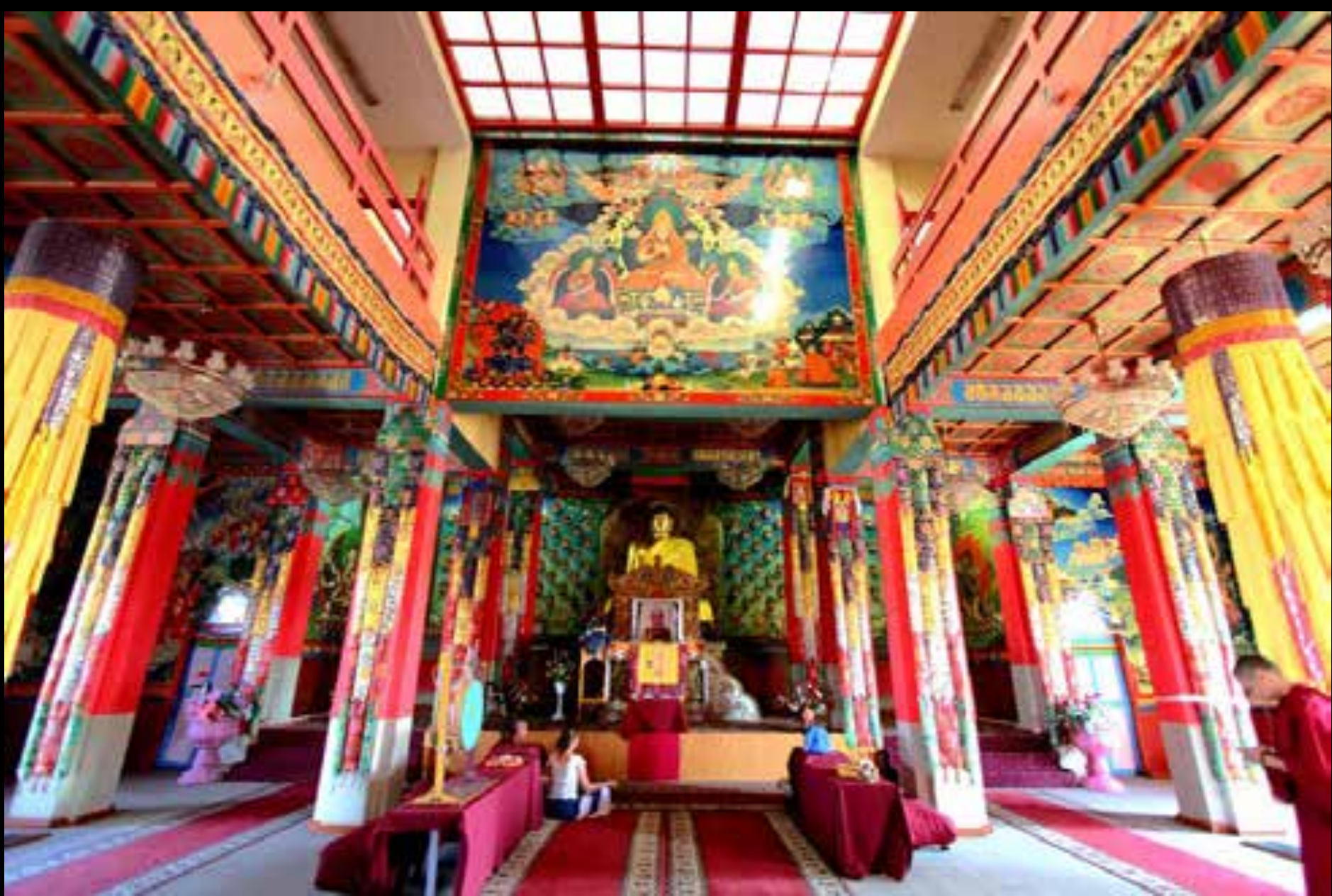
Interior, Khurul a Buddhist temple in Aarshaan, near Elista, Kalmykia, Russia.