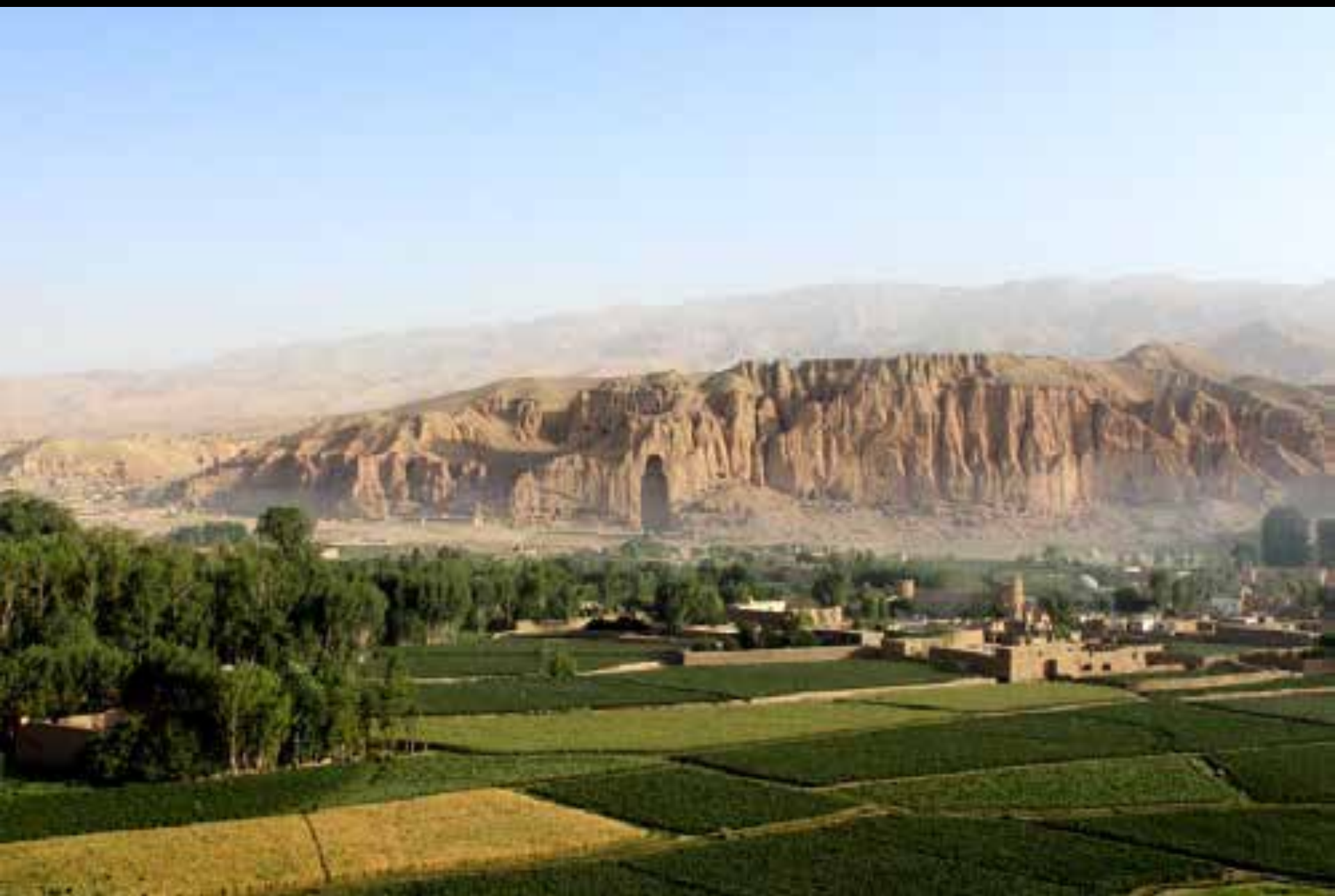
Bamiyan, Afghanistan.