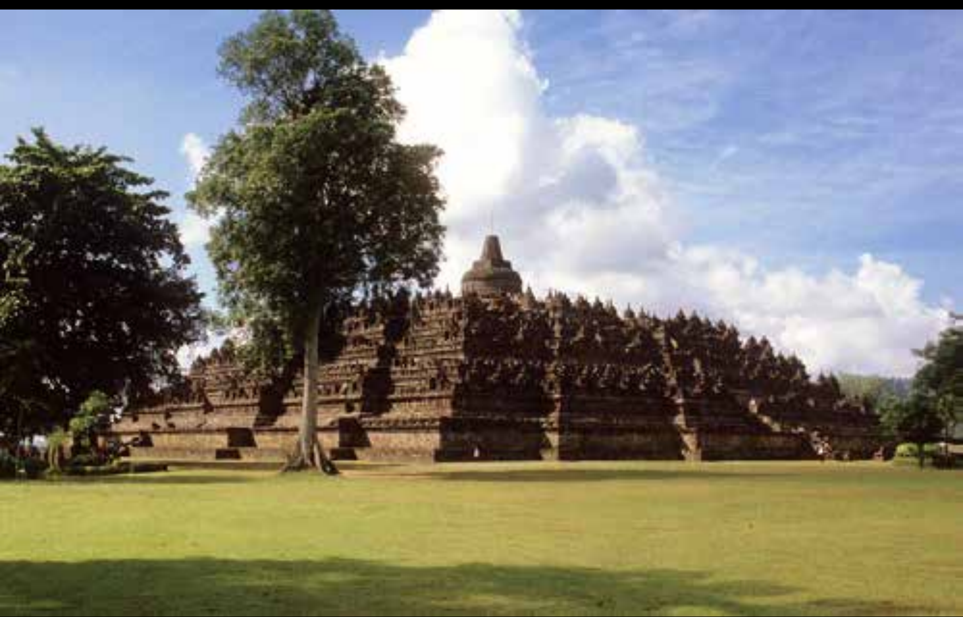
Borobudur Stupa, 8 th -9 th century AD, Java, Indonesia.