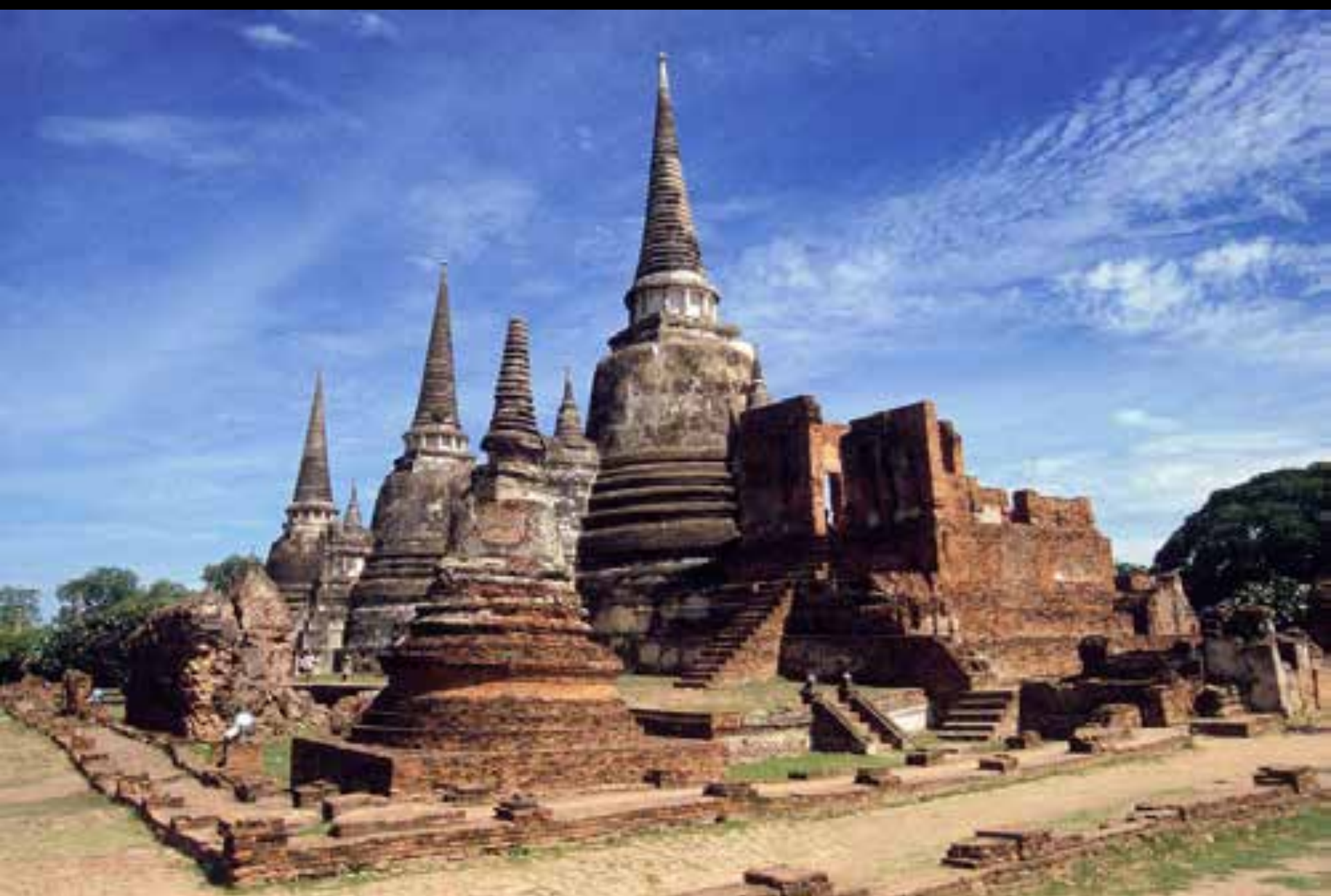
Wat Phra Si Sanphet, 15 th century, Ayutthaya, Thailand.