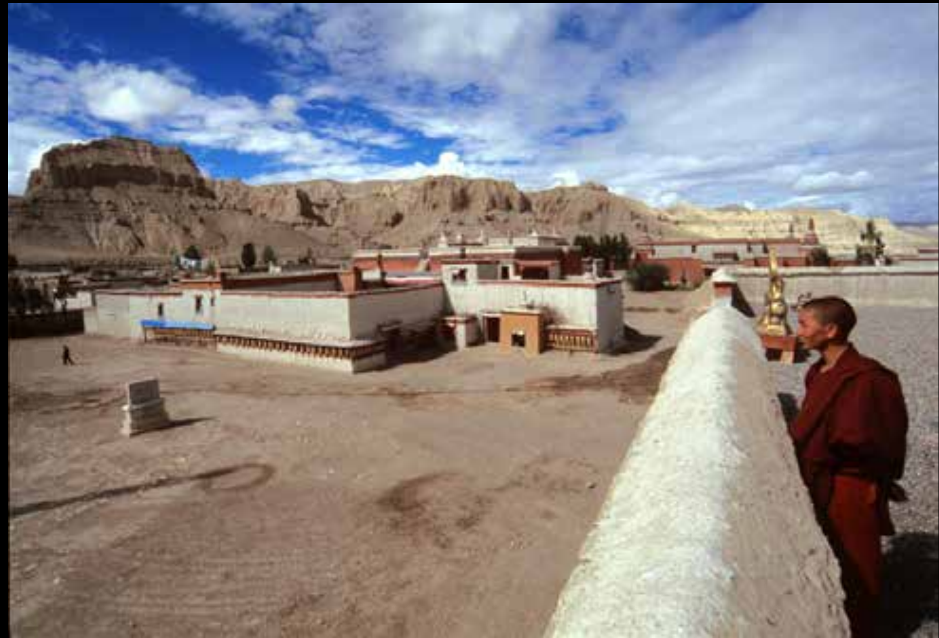
Tholing monastery, 996 AD, Zanda, Ngari, Western Tibet.