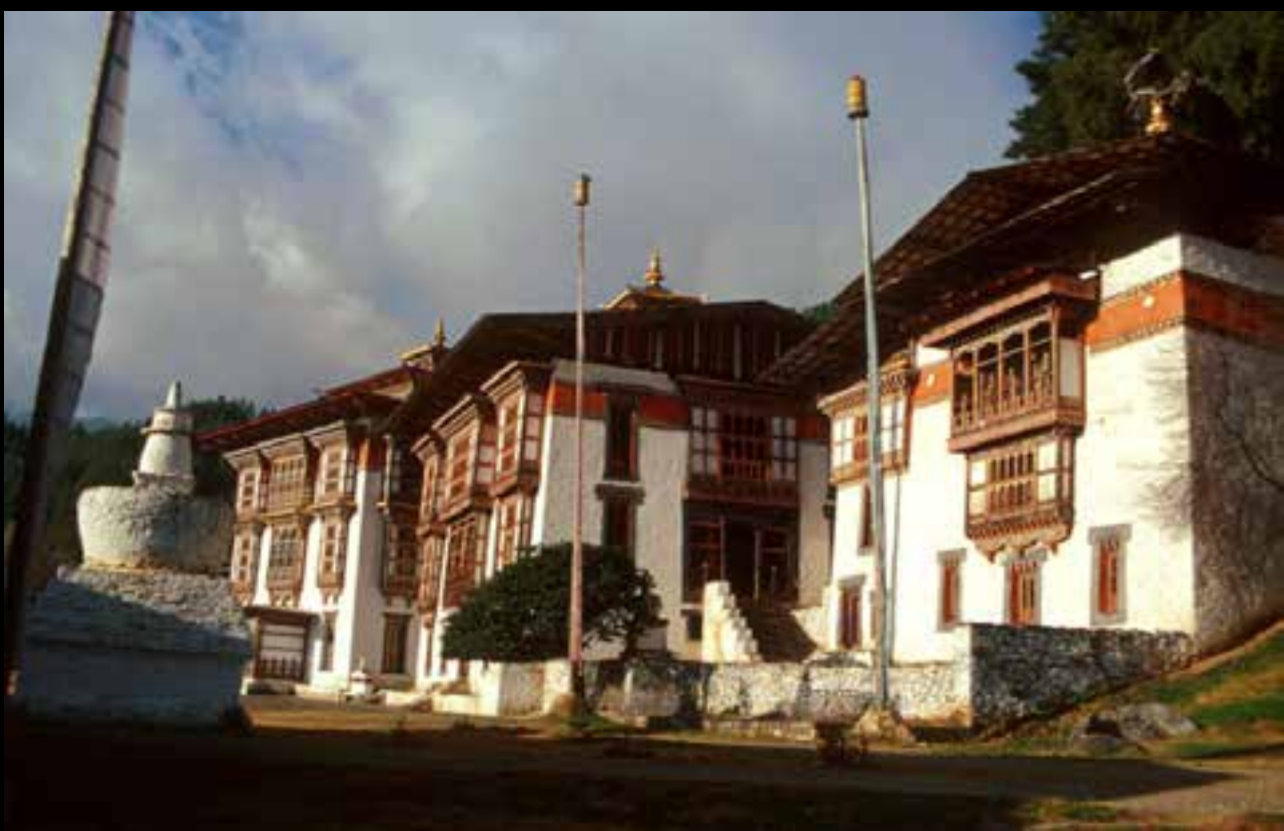
Kurje Monastery, Bumthang, Bhutan.