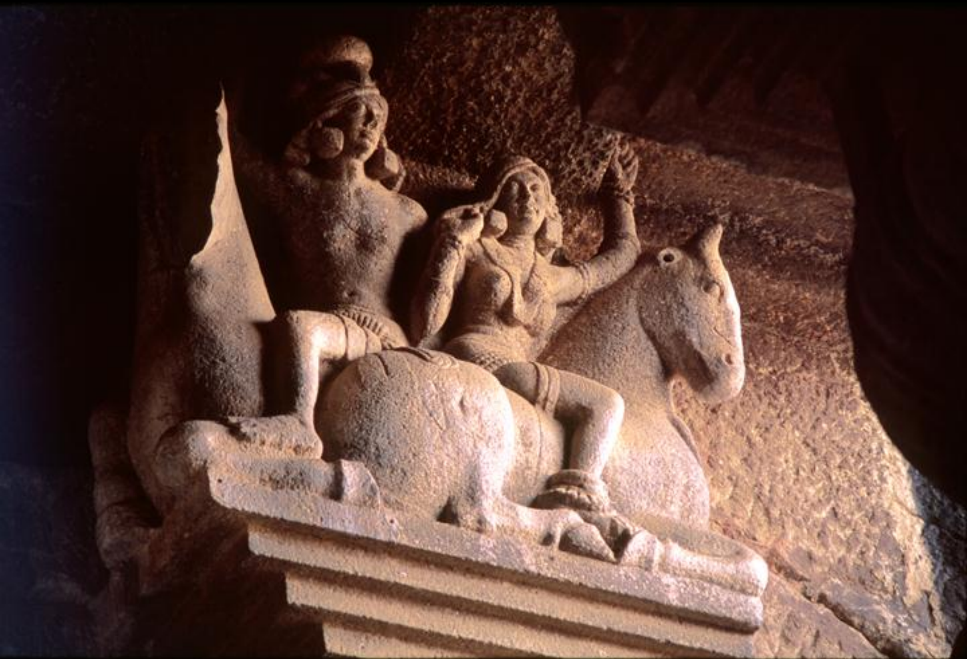
Riders on horses atop tall pillars, Bedsa, 1st century AD, Maharashtra, India.