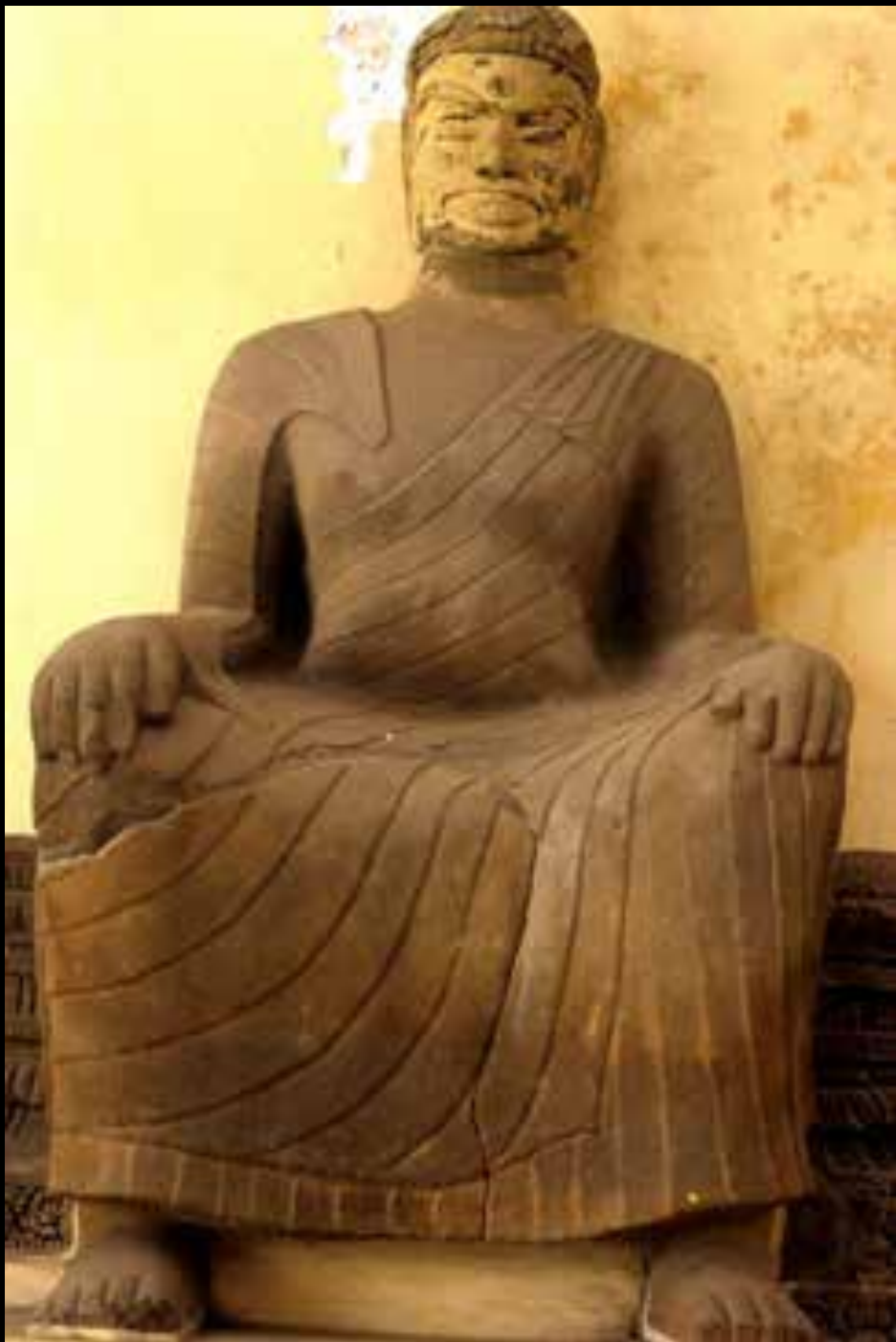
Seated Buddha, Dong Duong, Collection: Da Nang Museum, Vietnam.