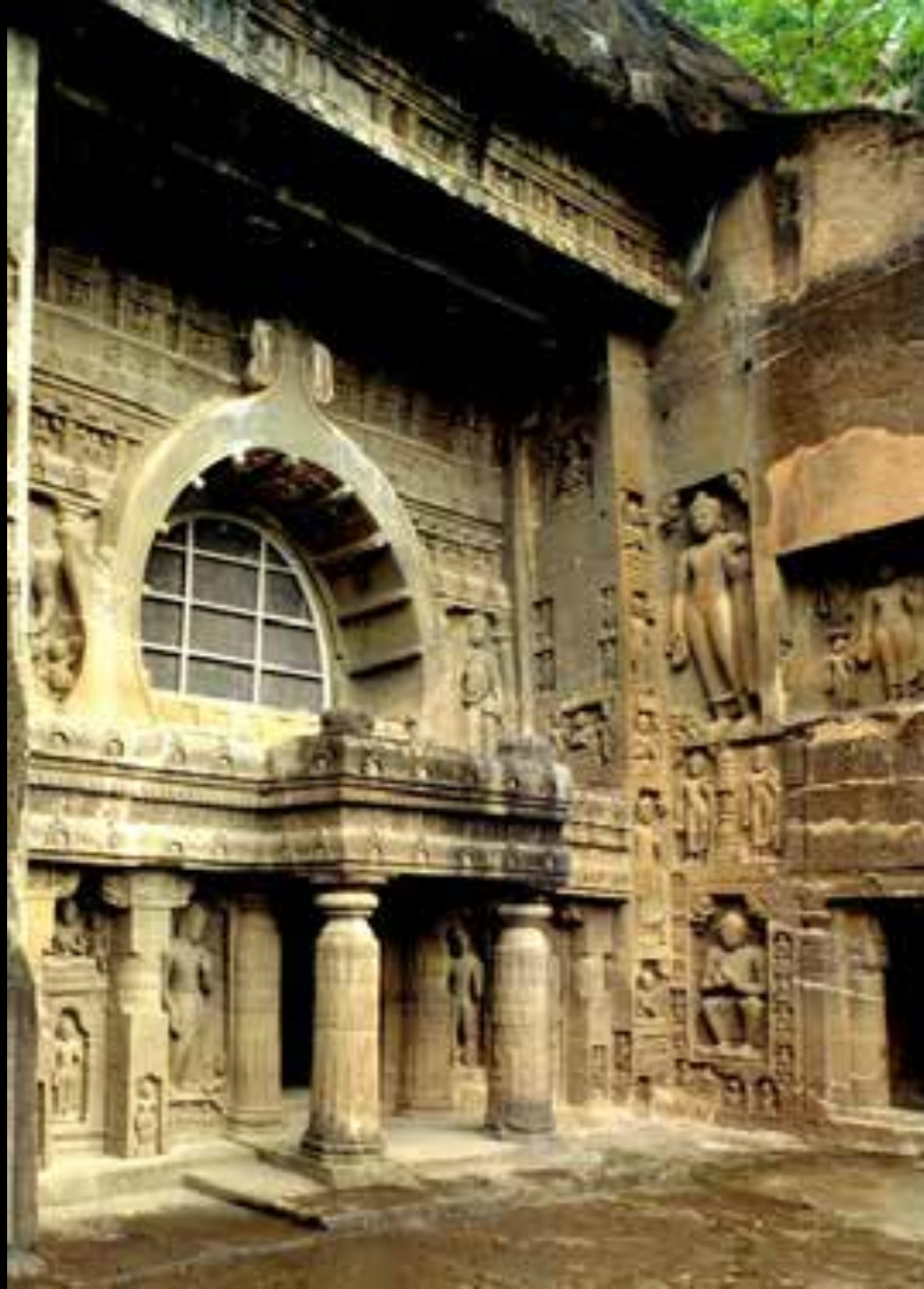
Cave 19, Ajanta, 5th century AD, Maharashtra, India.