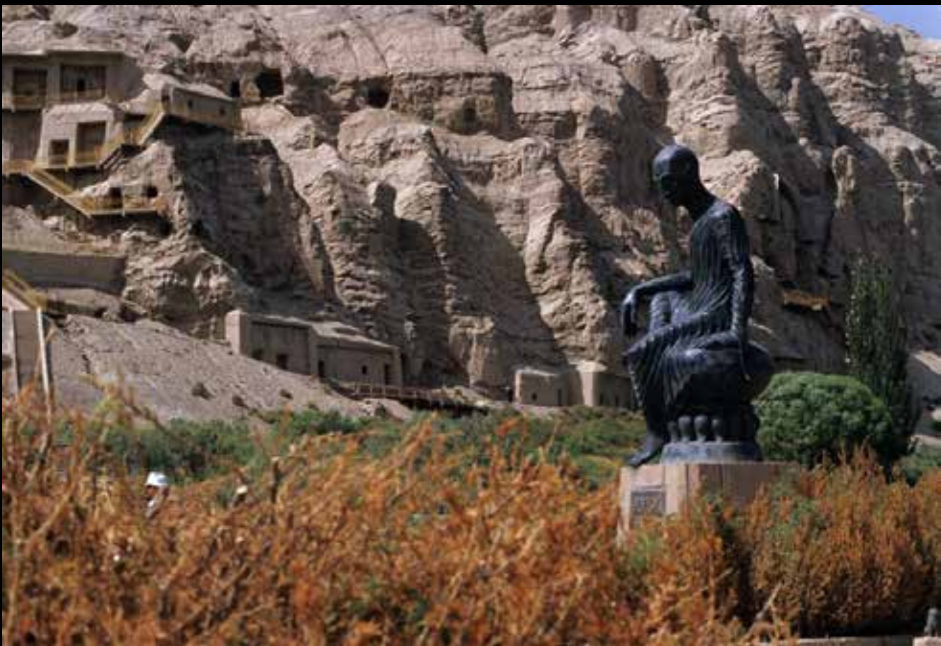
Statue of Kumarajiva, Kizil Caves, Kucha, China.