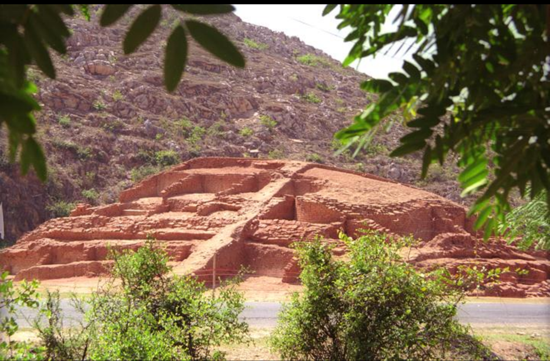
Kesaria Stupa, Bihar, India.