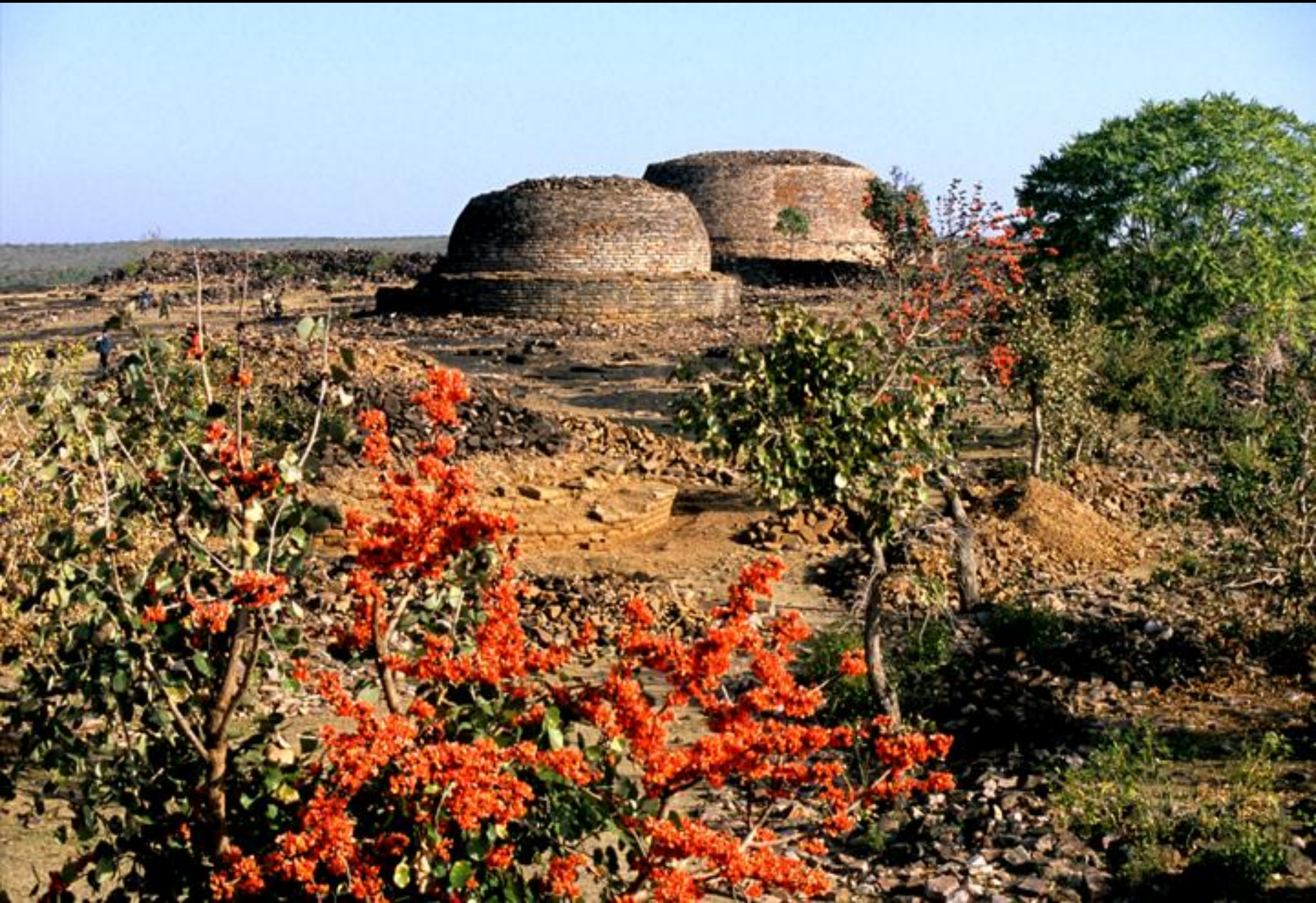
Pipaliya Stupa, Bhojpur, Madhya Pradesh, India.