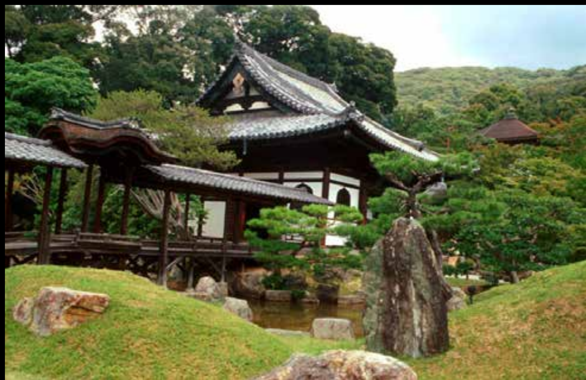
Ginkaku-ji Temple, Kyoto, 15 th century, Japan.