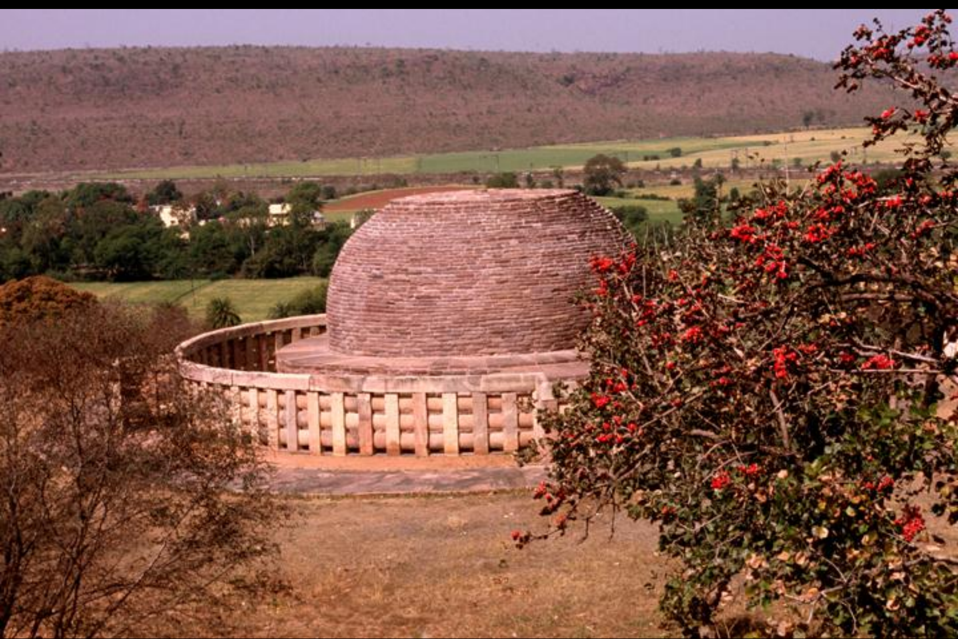
Stupa II, c. 100 BC, Sanchi, Madhya Pradesh, India.