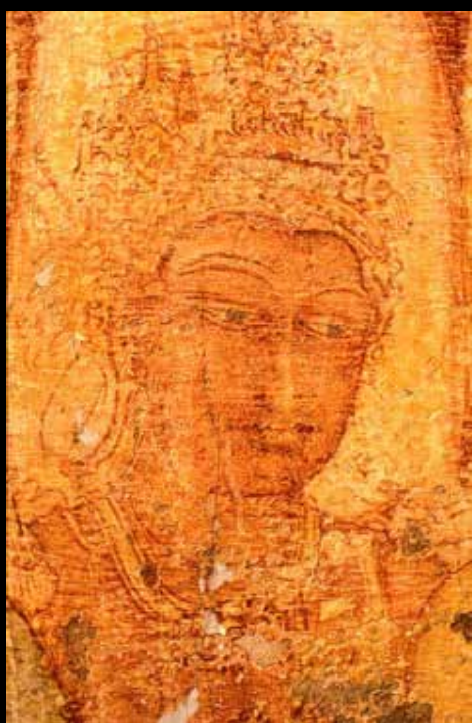
Bodhisattva, Mural, 12th century, Polonnaruwa Sri Lanka.