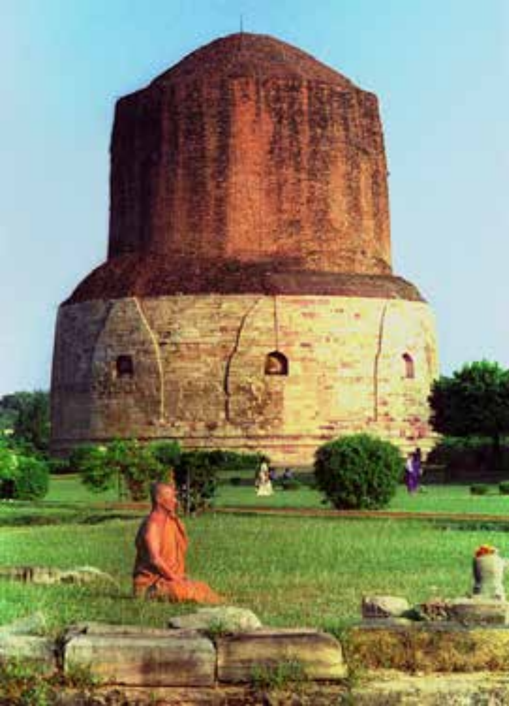
Dhamek Stupa, Sarnath, Uttar Pradesh, India.