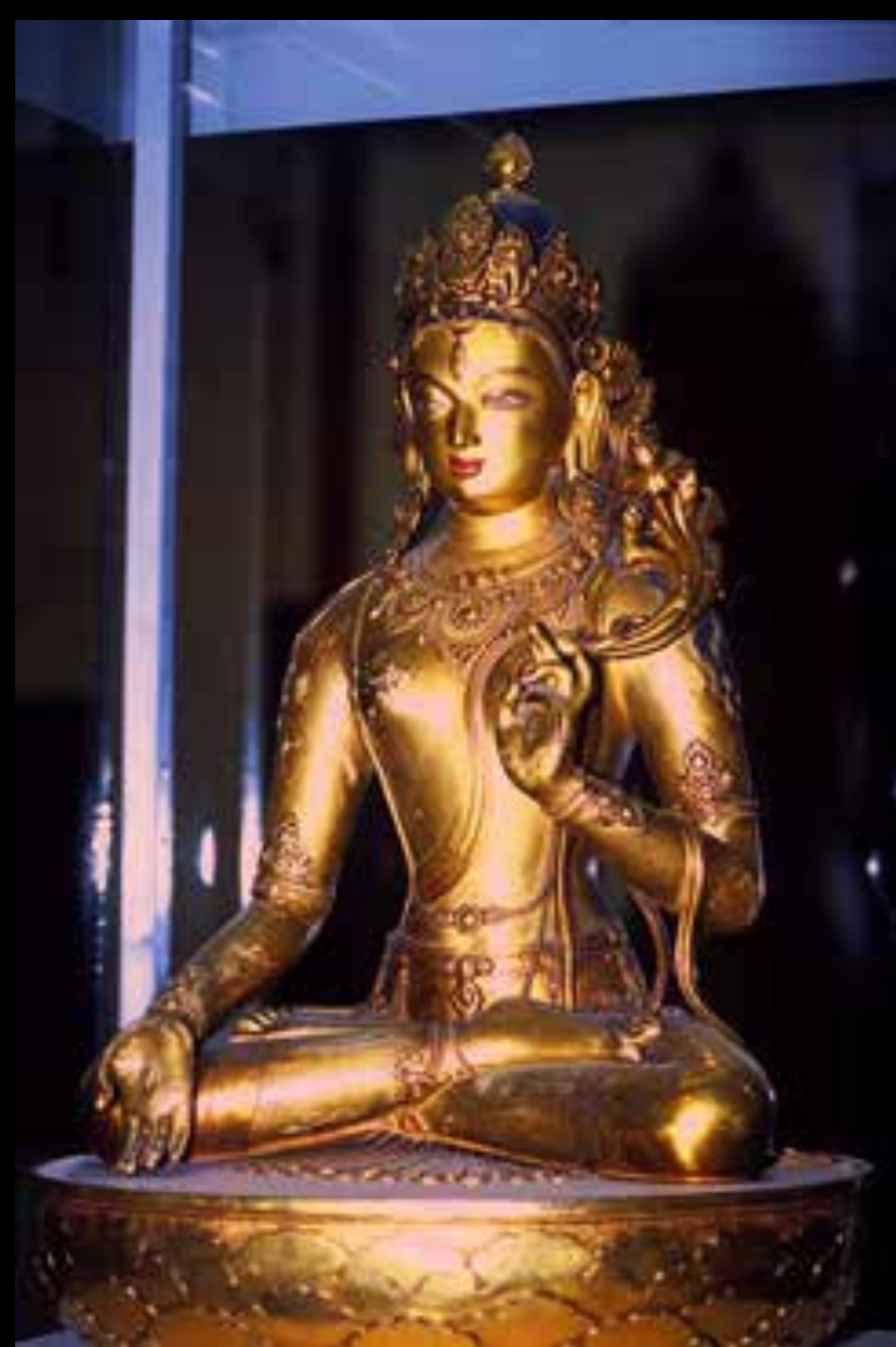
White Tara, 17th century, made by ruler Zanabazar, Zanabazar Museum, Ulaanbaatar, Mongolia.