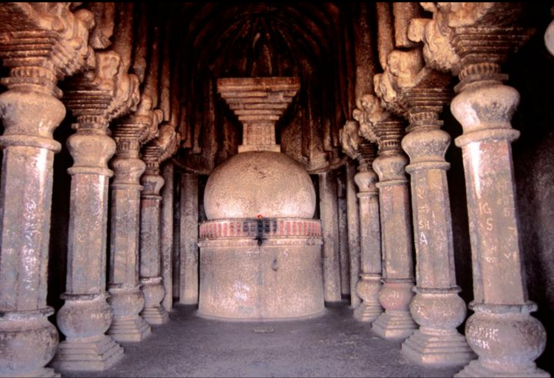
Stupa in cave interior, Junnar Caves, Maharashtra, India.