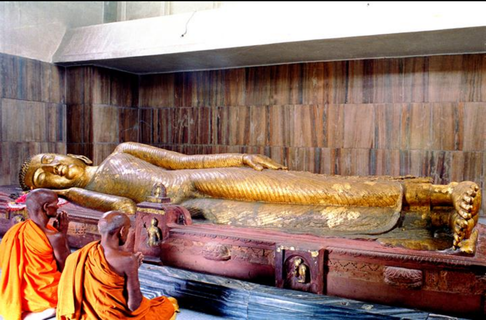
Gilded statue of the Parinirvana, Kushinagara, Uttar Pradesh, India.