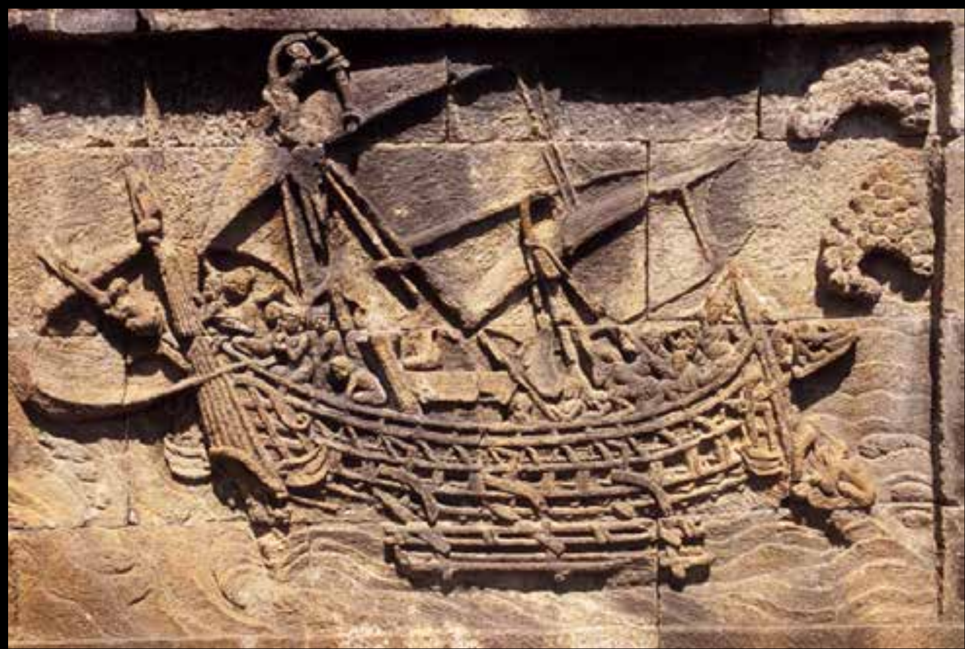
Relief, 8 th -9 th century, Borobudur Stupa, Indonesia.