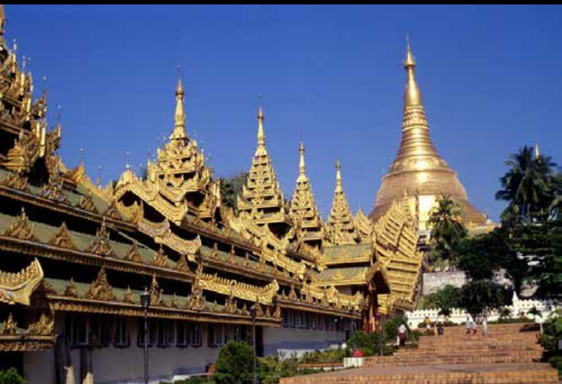
Shwedagon Pagoda, Yangon, Myanmar. Photograph by Benoy K Behl