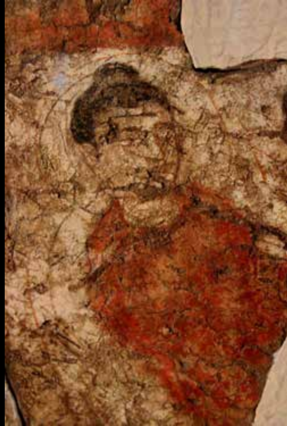
Buddha, Mural from Fayaz- Tepe, 1st-2nd century, Collection: Tashkent National Museum, Uzbekistan.