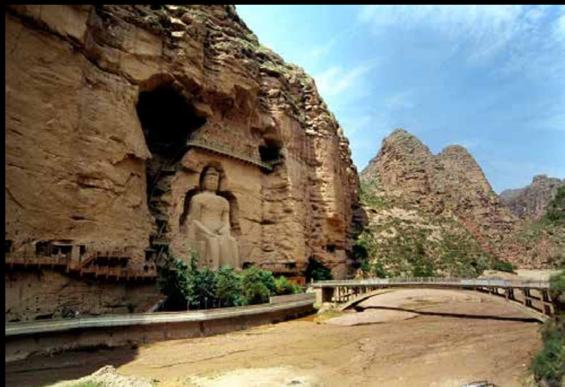
Colossal Buddha, Bingling Si, China. Photograph by Benoy K Behl