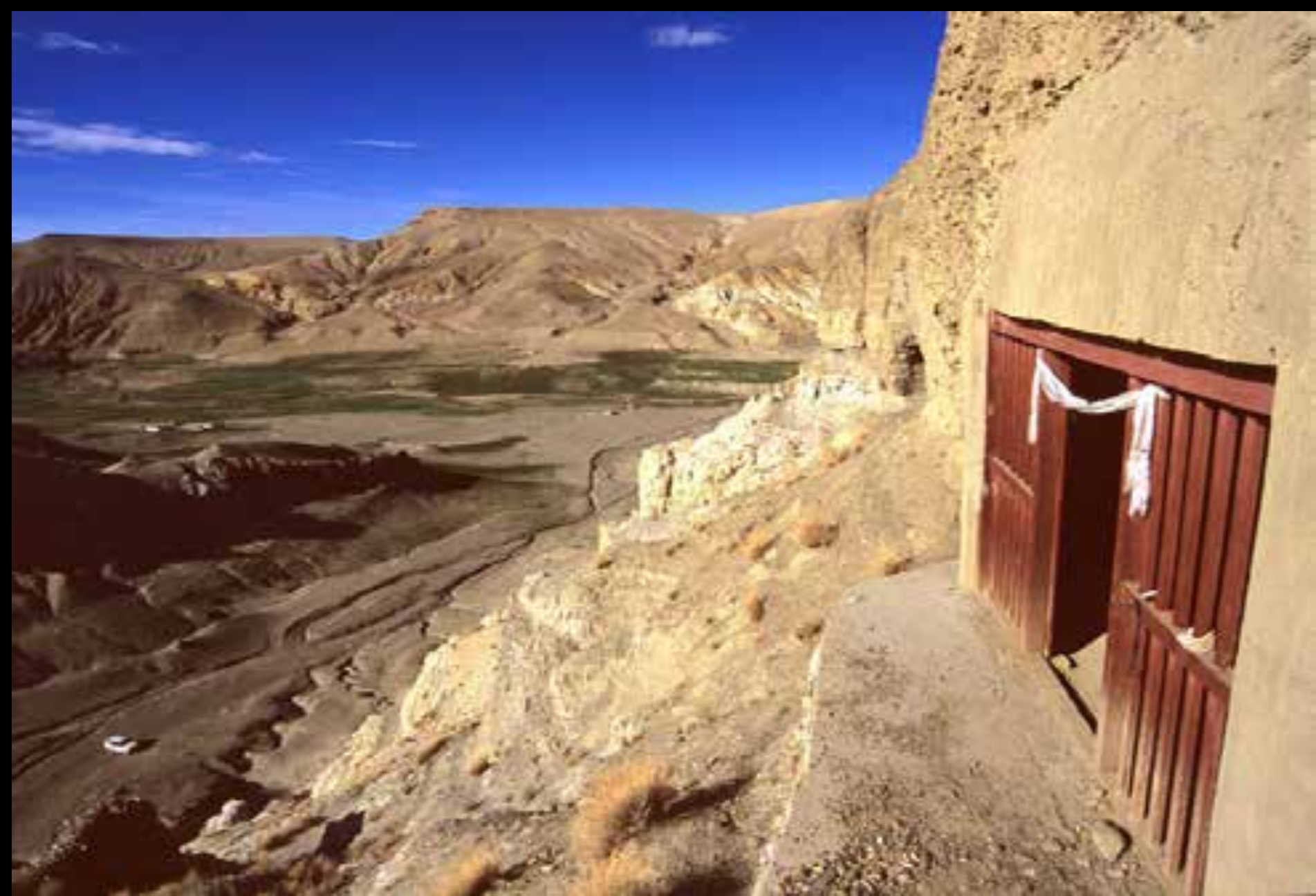
Dungkar Caves, c. 10 th century AD, Western Tibet.