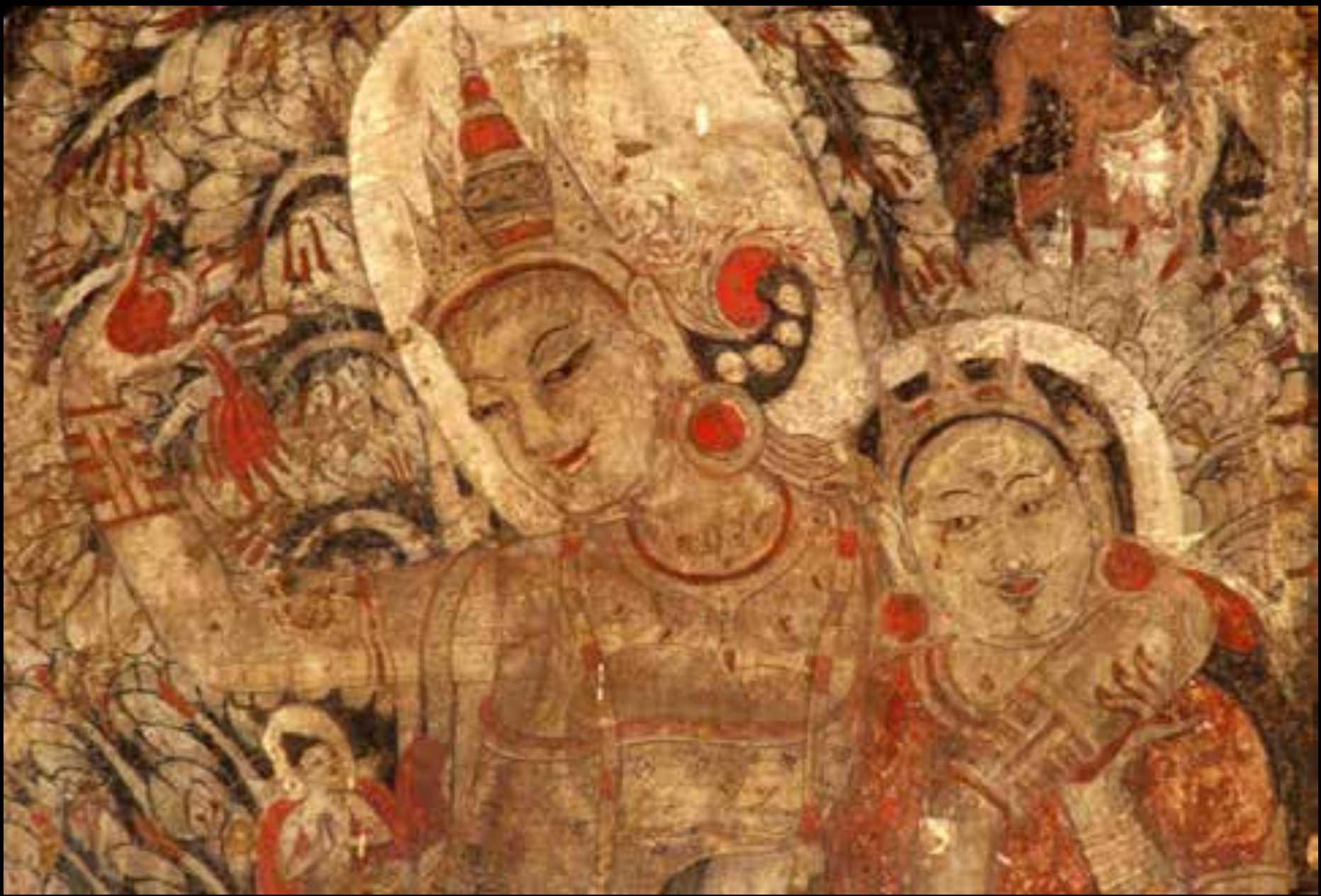
Birth of the Buddha, Mural, Loka Hteik Pann Pagoda, 12th cent., Bagan, Myanmar.