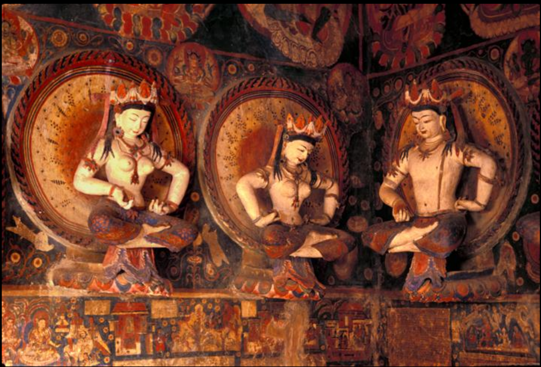
Clay sculptures, Suglhakhang, late 10 th / early 11th century AD, Tabo, Spiti, Himachal Pradesh, India.