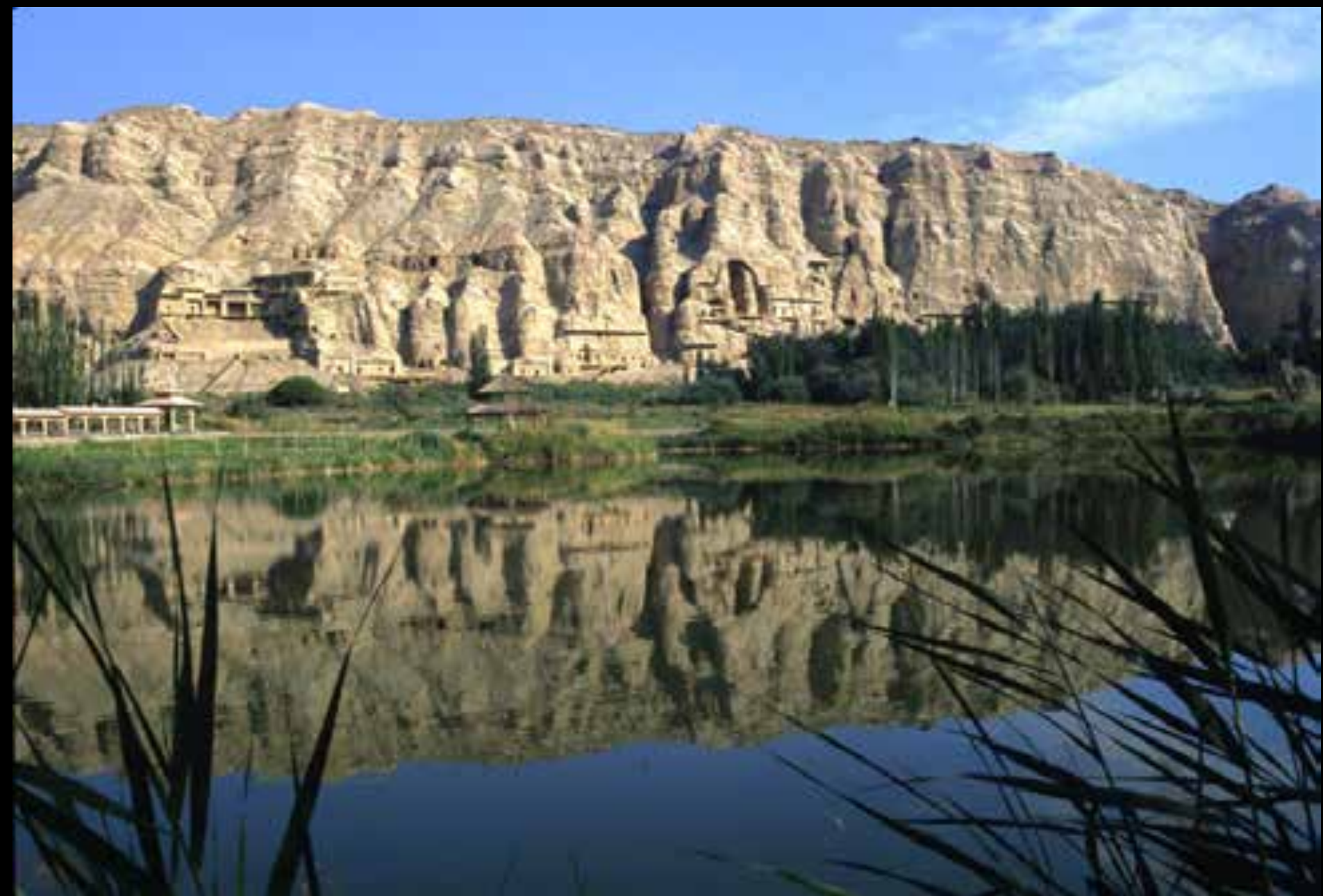
Kizil Caves, Kucha, China.