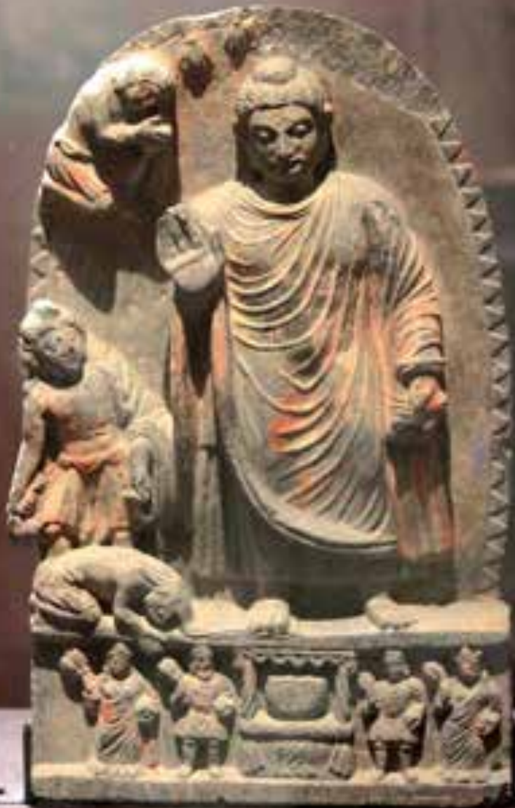
Recently excavated Buddha, Mes Aynak site, Afghanistan.