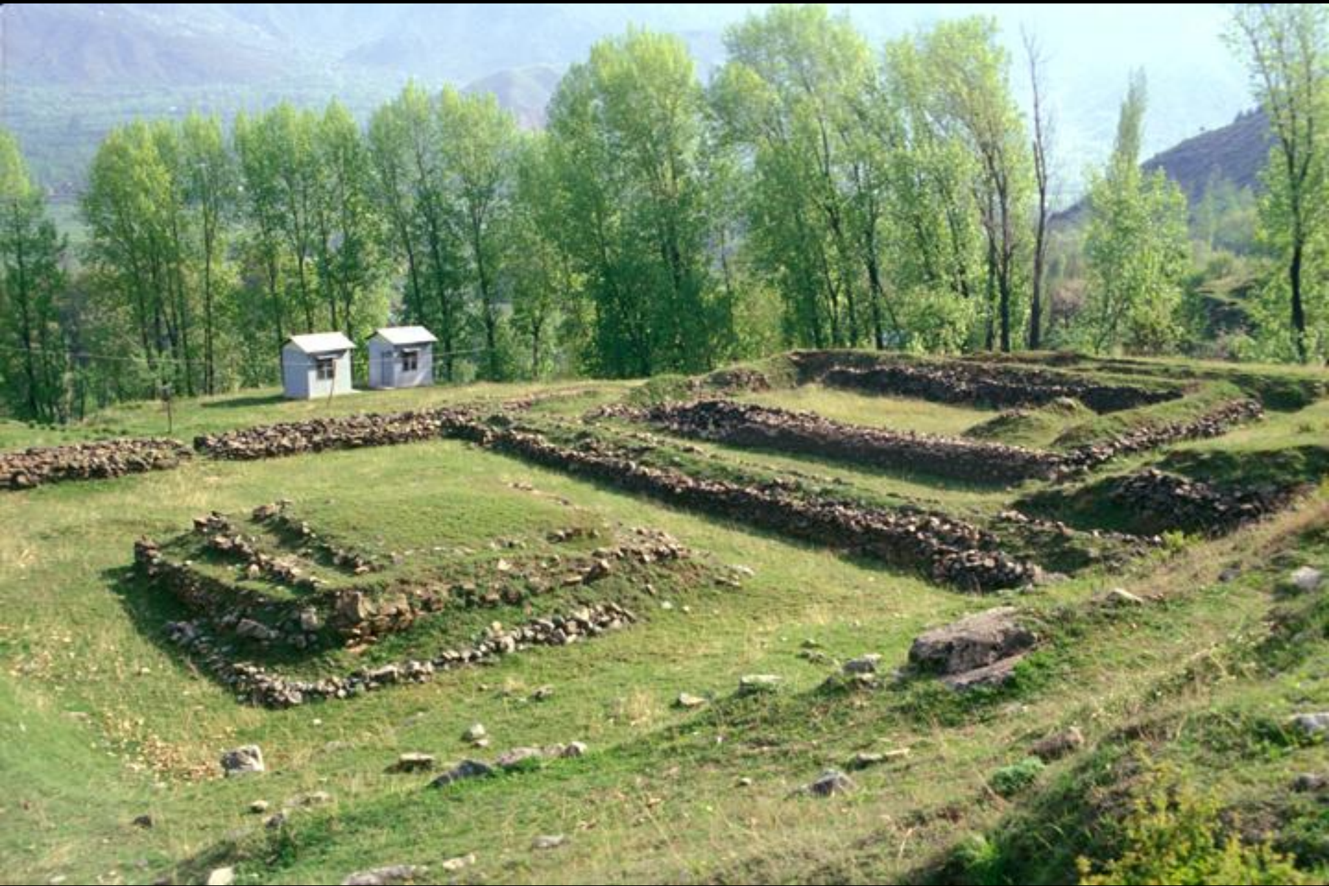
Buddhist site, Harwan, c. 4th century AD, near Srinagar, Kashmir, India.