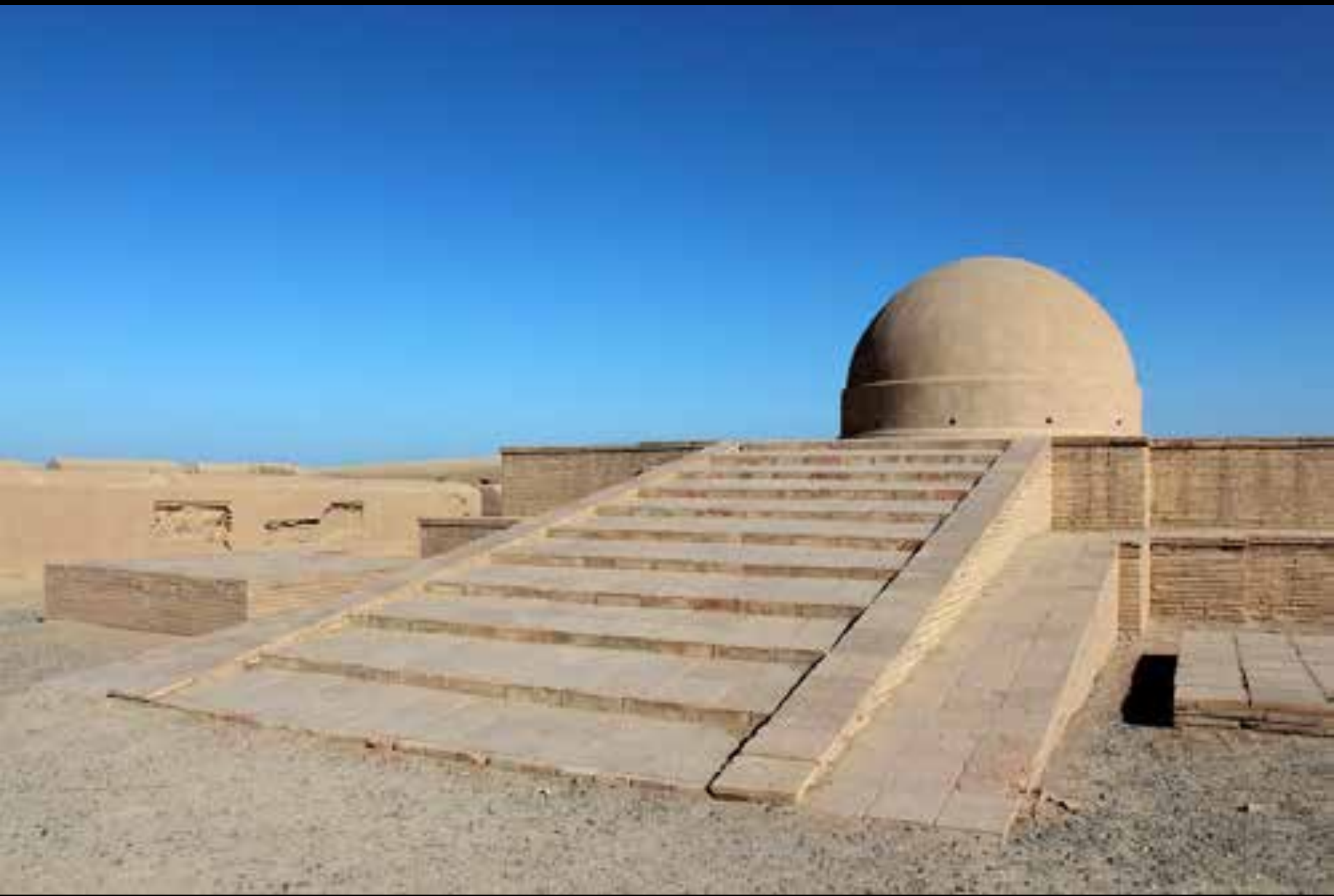
Fayaz-Tepe, stupa near Termez, 1 st – 3 rd century AD, Uzbekistan. Photograph by Benoy K Behl