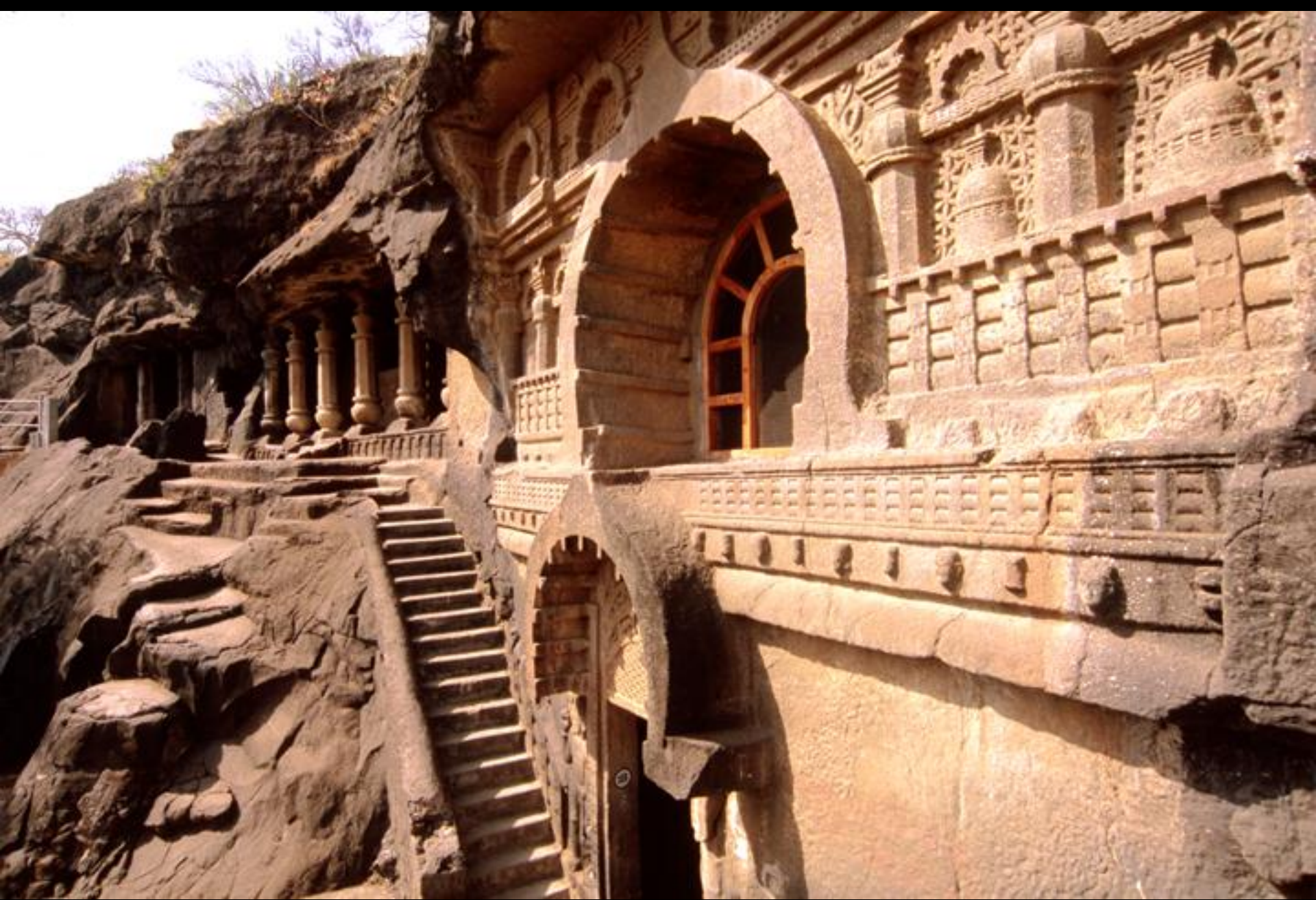
Nashik caves, 2nd century AD, Maharashtra, India.