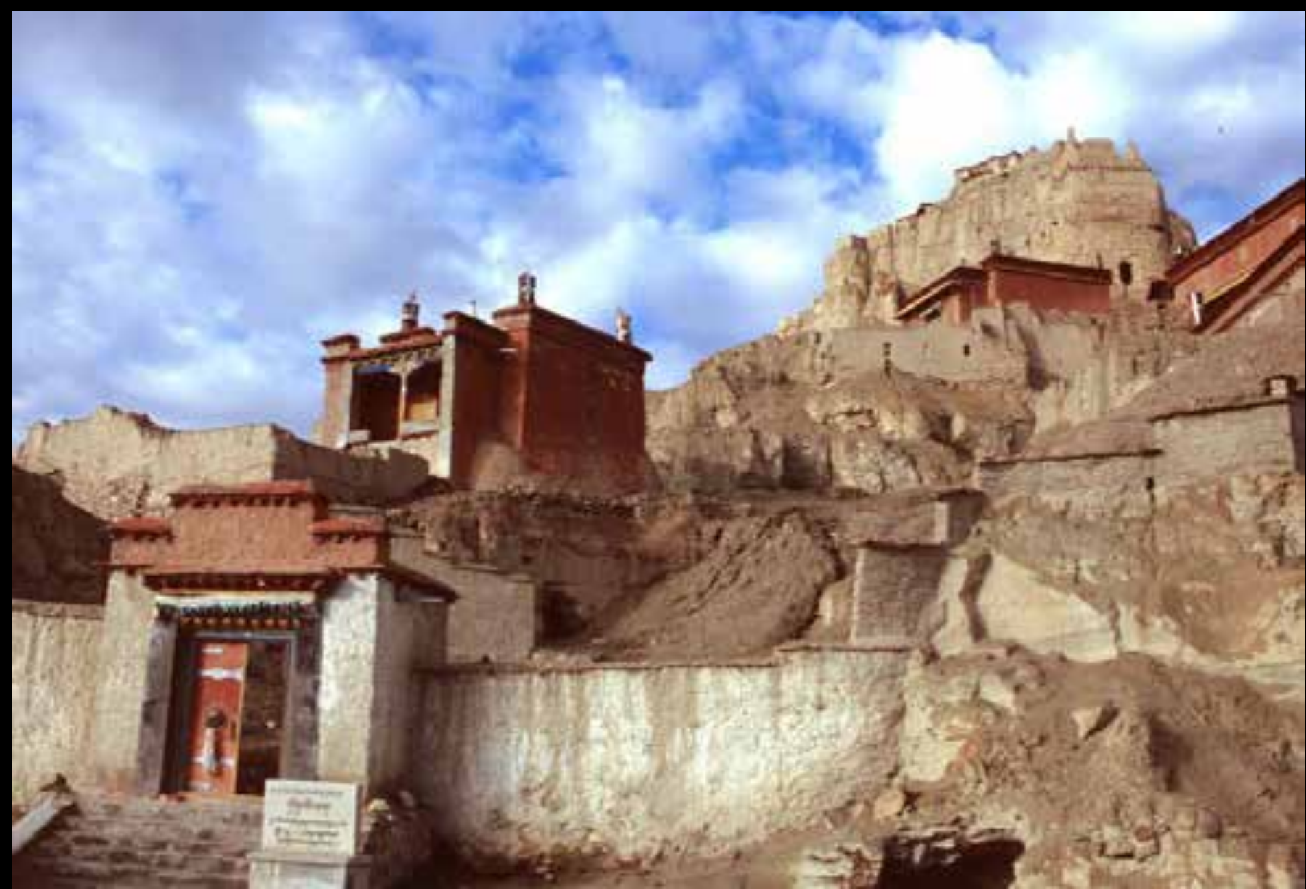
Guge castle remains, Tsaparang, Tibet.