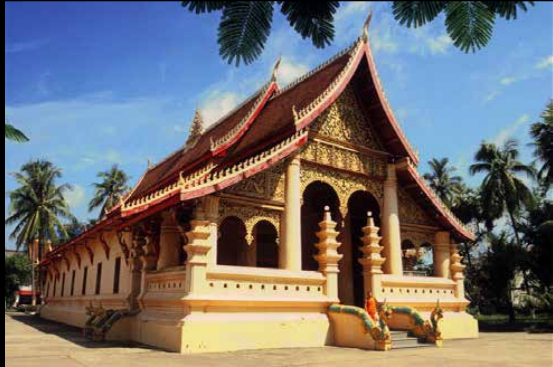
Ongtue Temple, Vientiane, Laos.