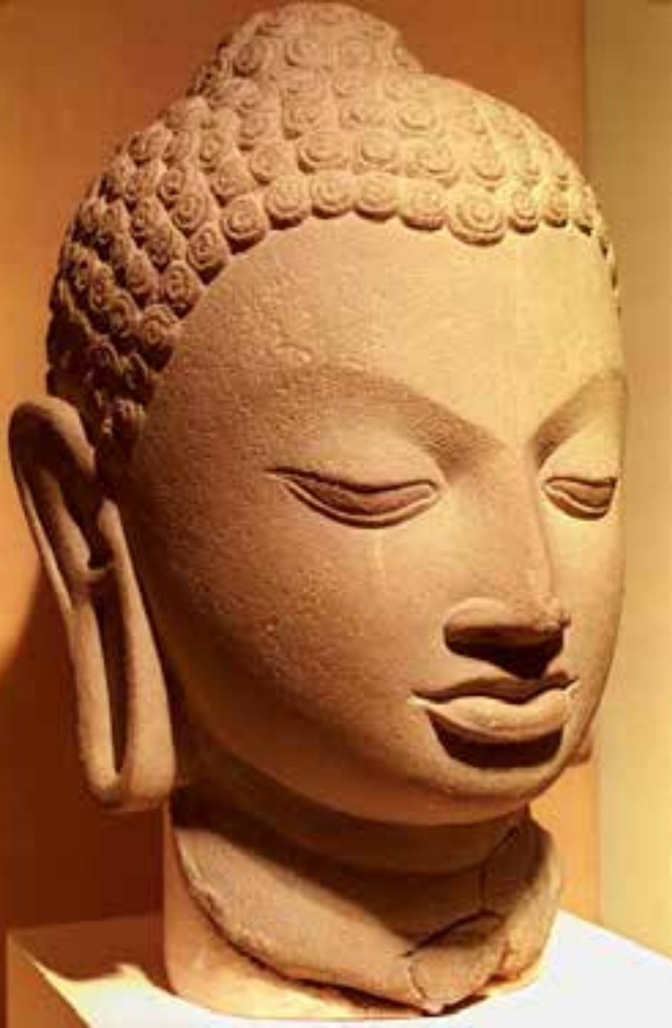
The Buddha, 5 th century AD, Sarnath, Uttar Pradesh, India.