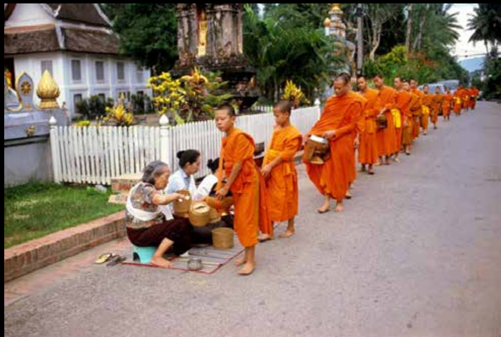
Arms giving in Luang Prabang, Laos.