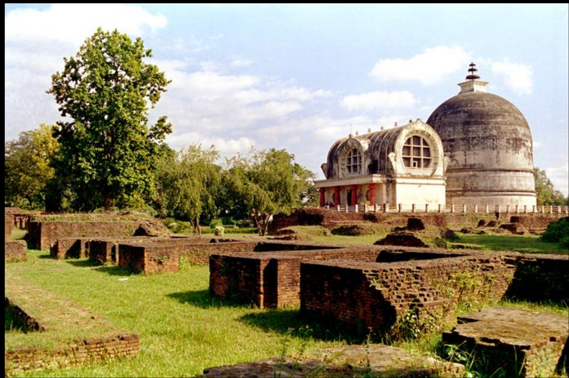
Chaitya-griha, Kushinagara, Uttar Pradesh, India.