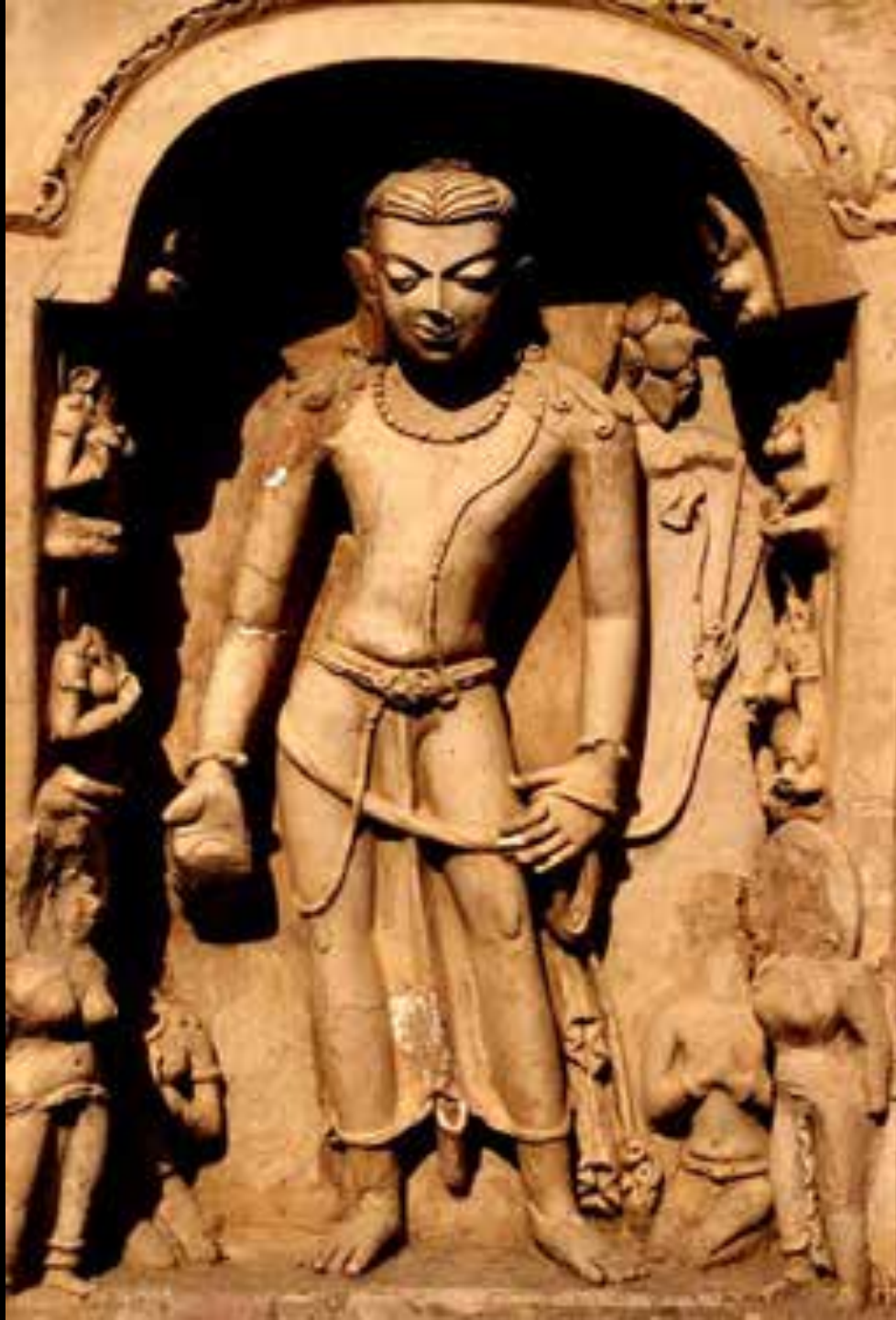
Bodhisattva, main temple, Nalanda site, Bihar, India.