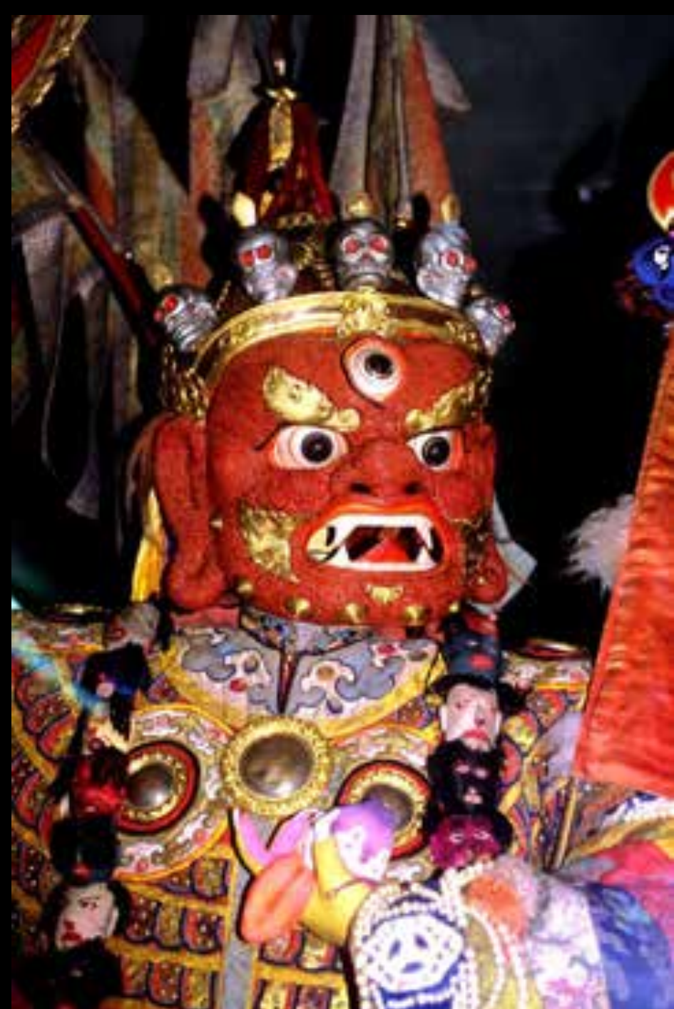
Cham Mask and dress, 19th century, Mongolia.