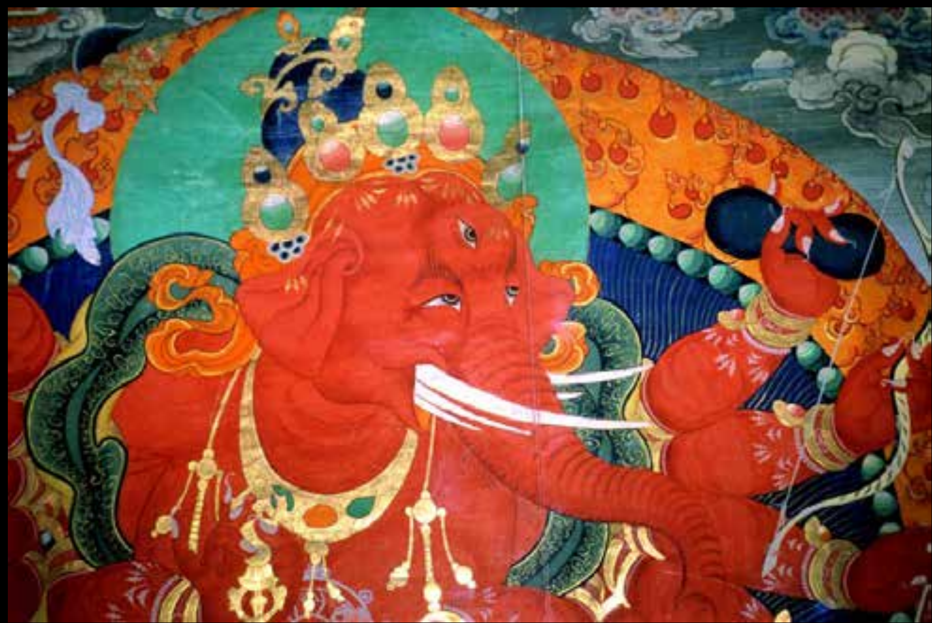
Three-eyed Ganesa, Tangkha, Late 19th century, Bogd Khan Palace Museum, Ulaanbaatar, Mongolia.