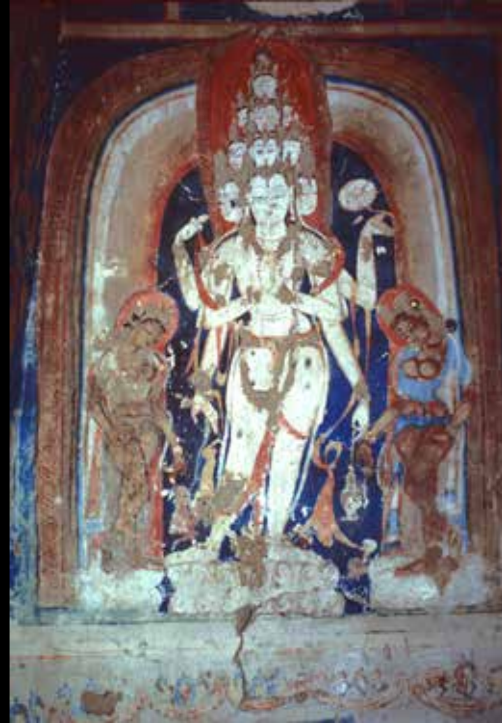
Eleven-headed Avaloketiswara, Mural, Dungkar Caves, Western Tibet.