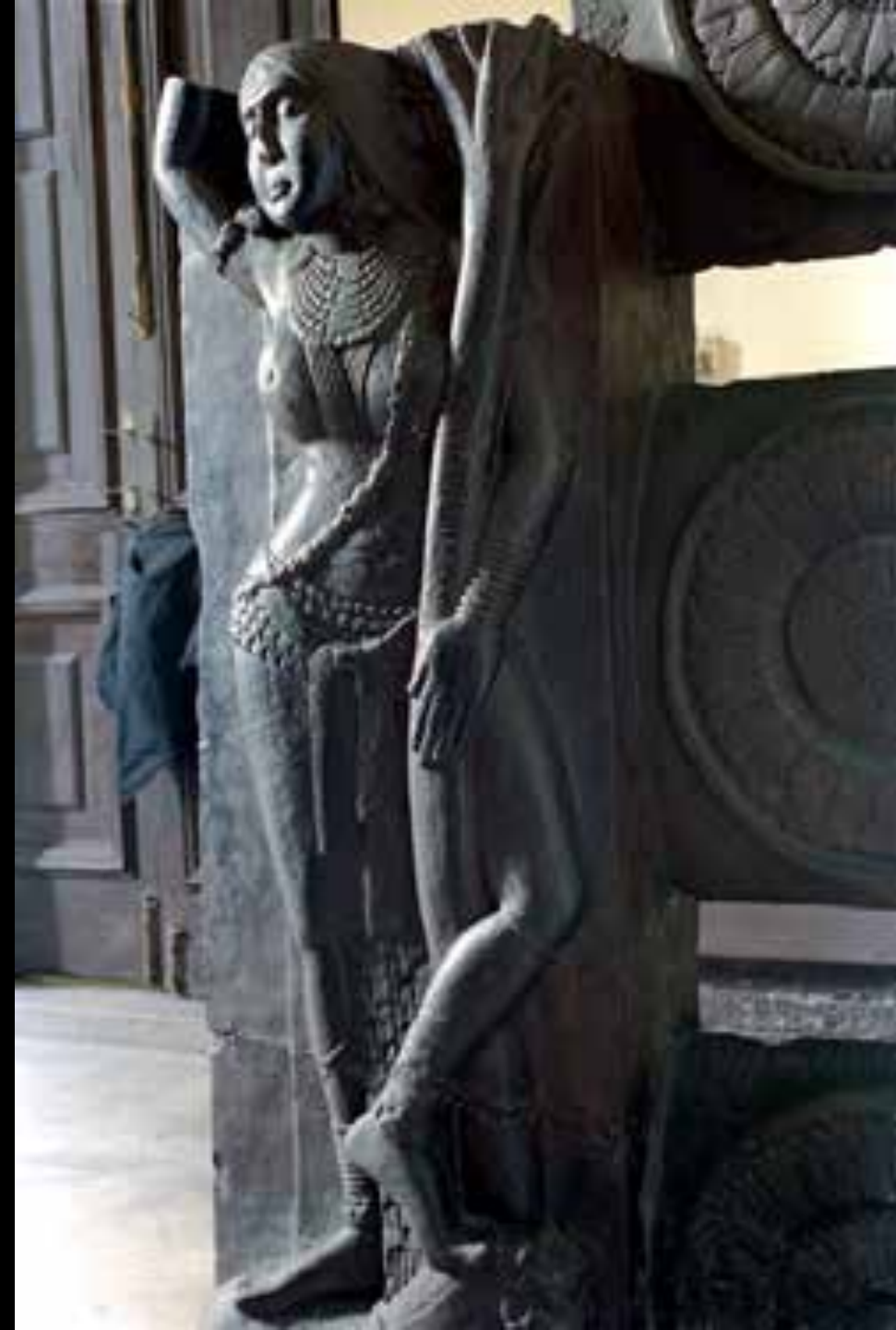
Gateway and Railing of Bharhut Stupa 2nd century BC, Madhya Pradesh, India.