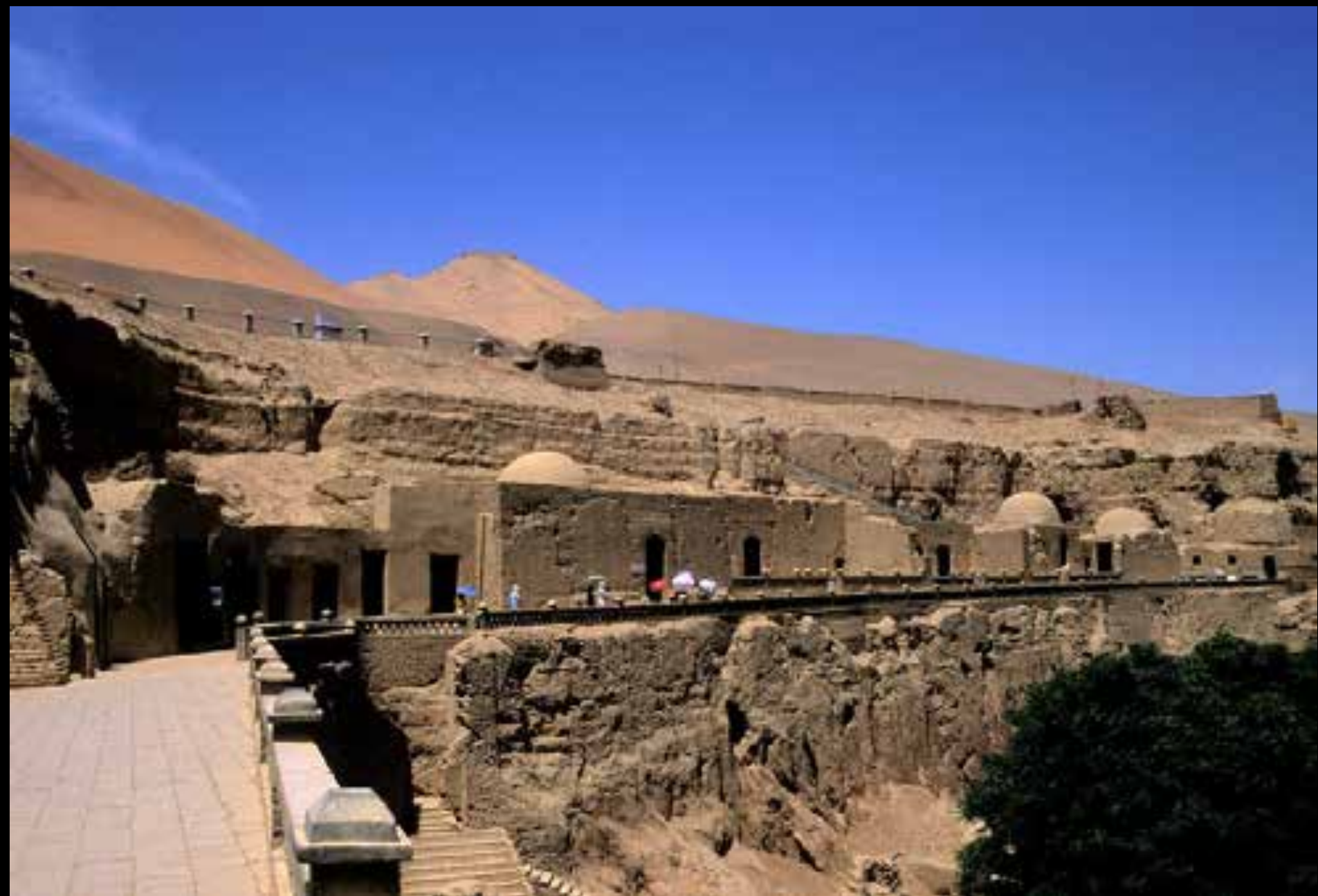
Bezeklik Caves, China. Photograph by Benoy K Behl