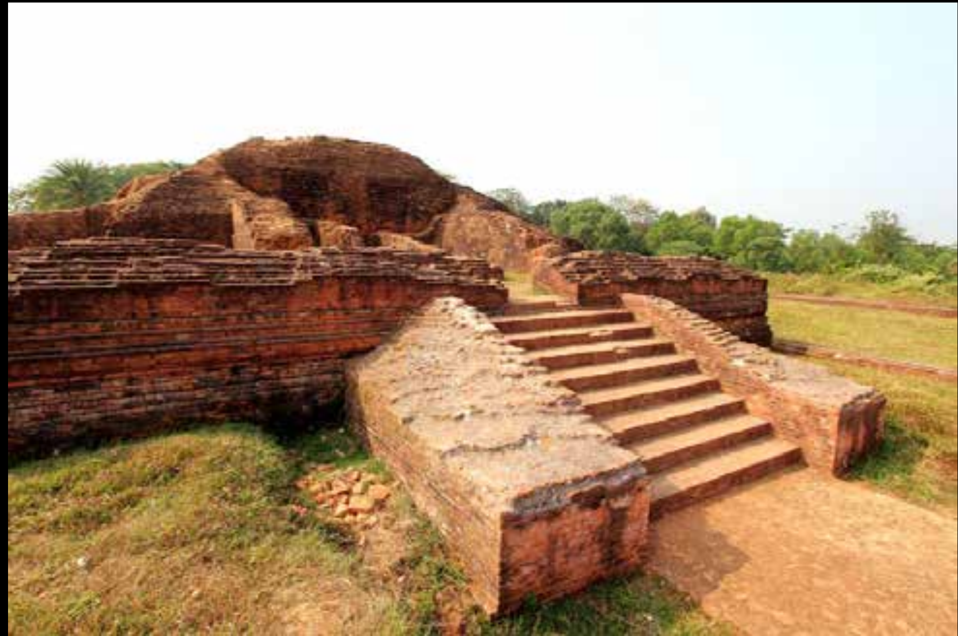
Rupbon Mura Vihara, 7th AD, Buddhist site, Mainamati, Bangladesh.