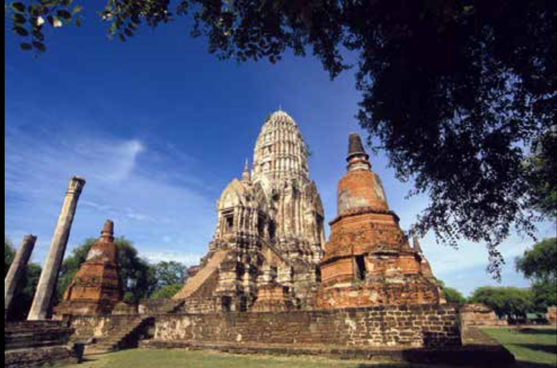
Wihan Luang, Wat Ratcha Burana, 15 th century, Ayutthaya, Thailand. Photograph by Benoy K Behl