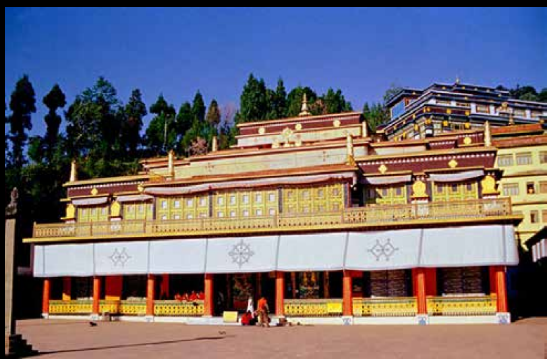
Rumtek Monastery, Sikkim, India. Photograph by Benoy K Behl