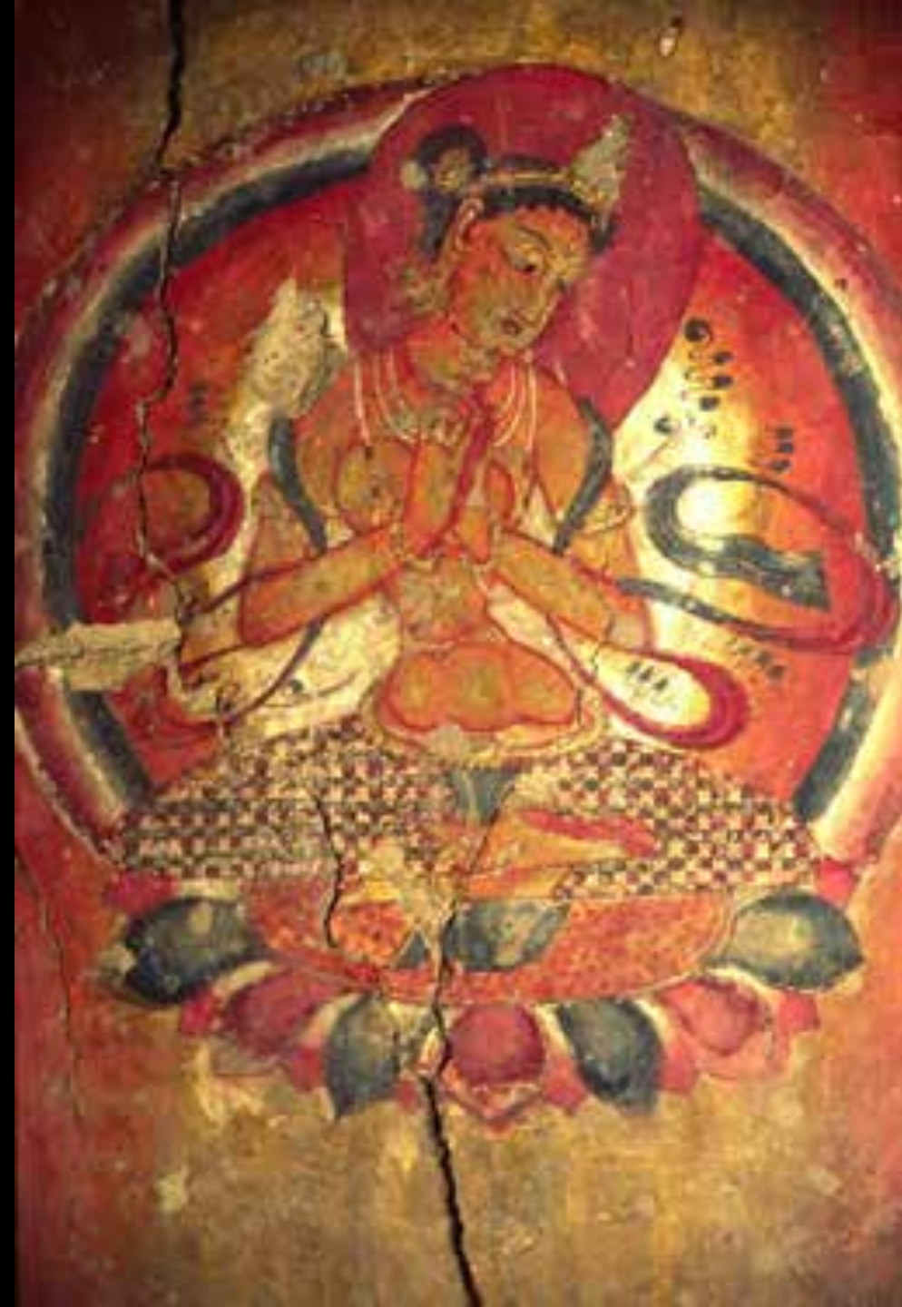
Detail of Mandala, Mural, 11th / 12th century AD, Nako Monastery, Spiti, Himachal Pradesh, India.