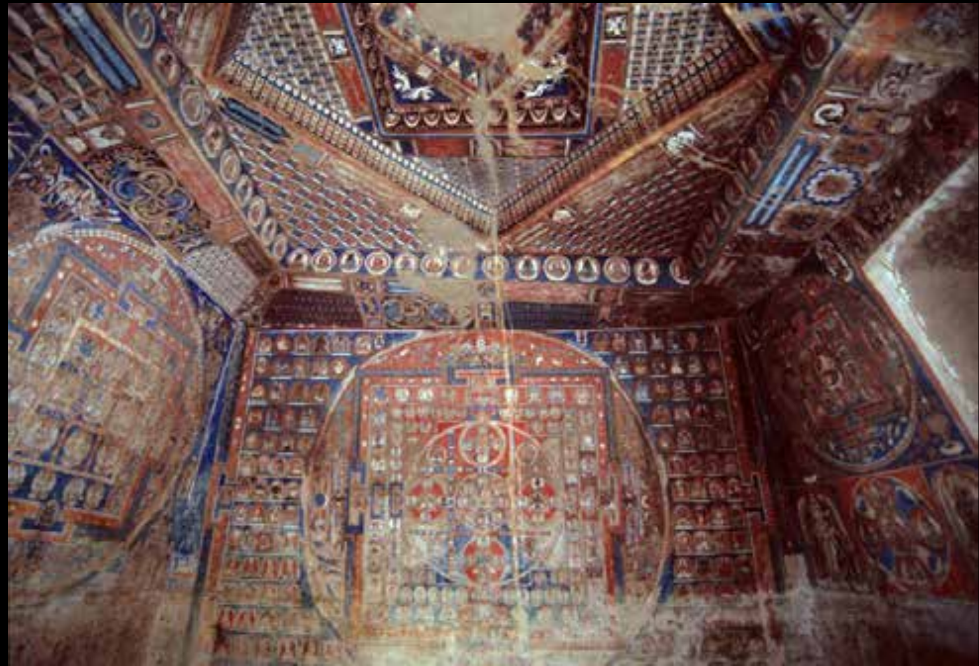
Painted Interior, South Facing Cave 1, Dungkar, Western Tibet.