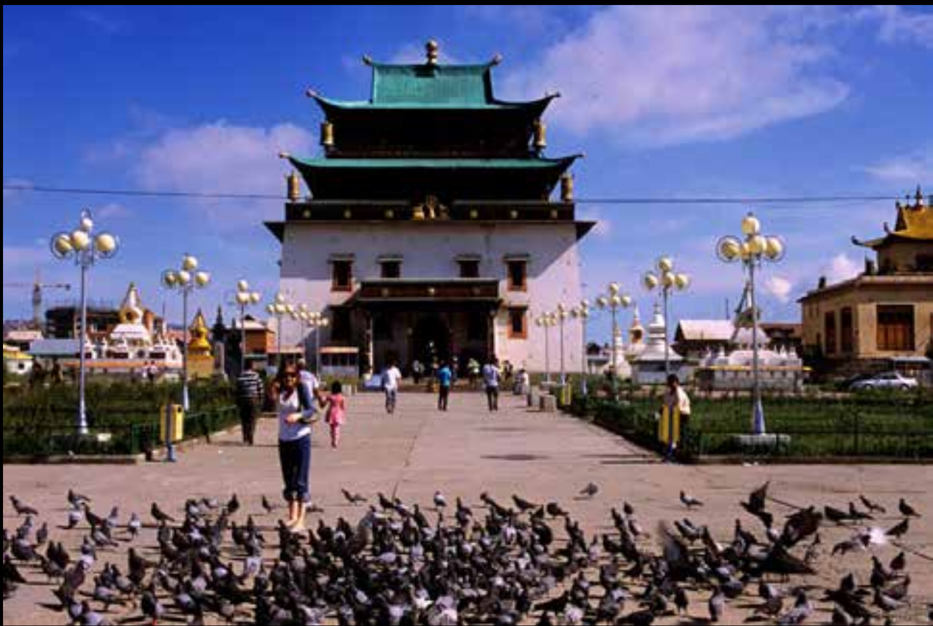
Gandan Monastery, Ulaanbaatar, Mongolia.