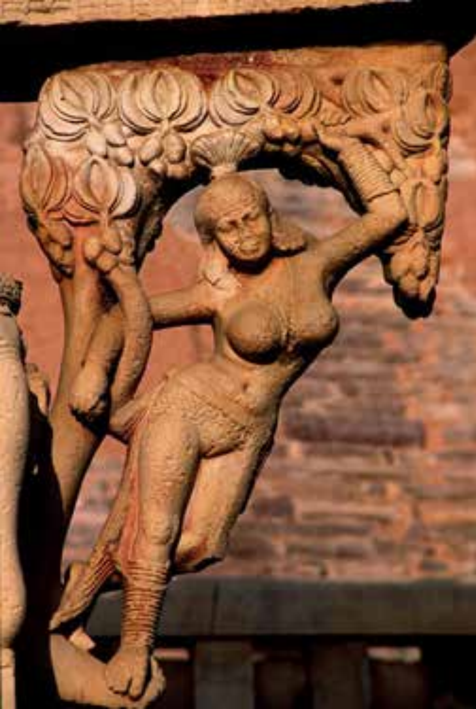
Shalabhanjika, East Gateway, Stupa I, Sanchi, 1 st century AD, Madhya Pradesh, India.