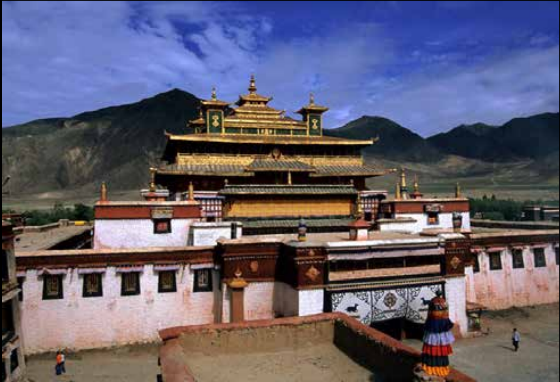
Samye Monastery, 8 th century AD, Central Tibet.