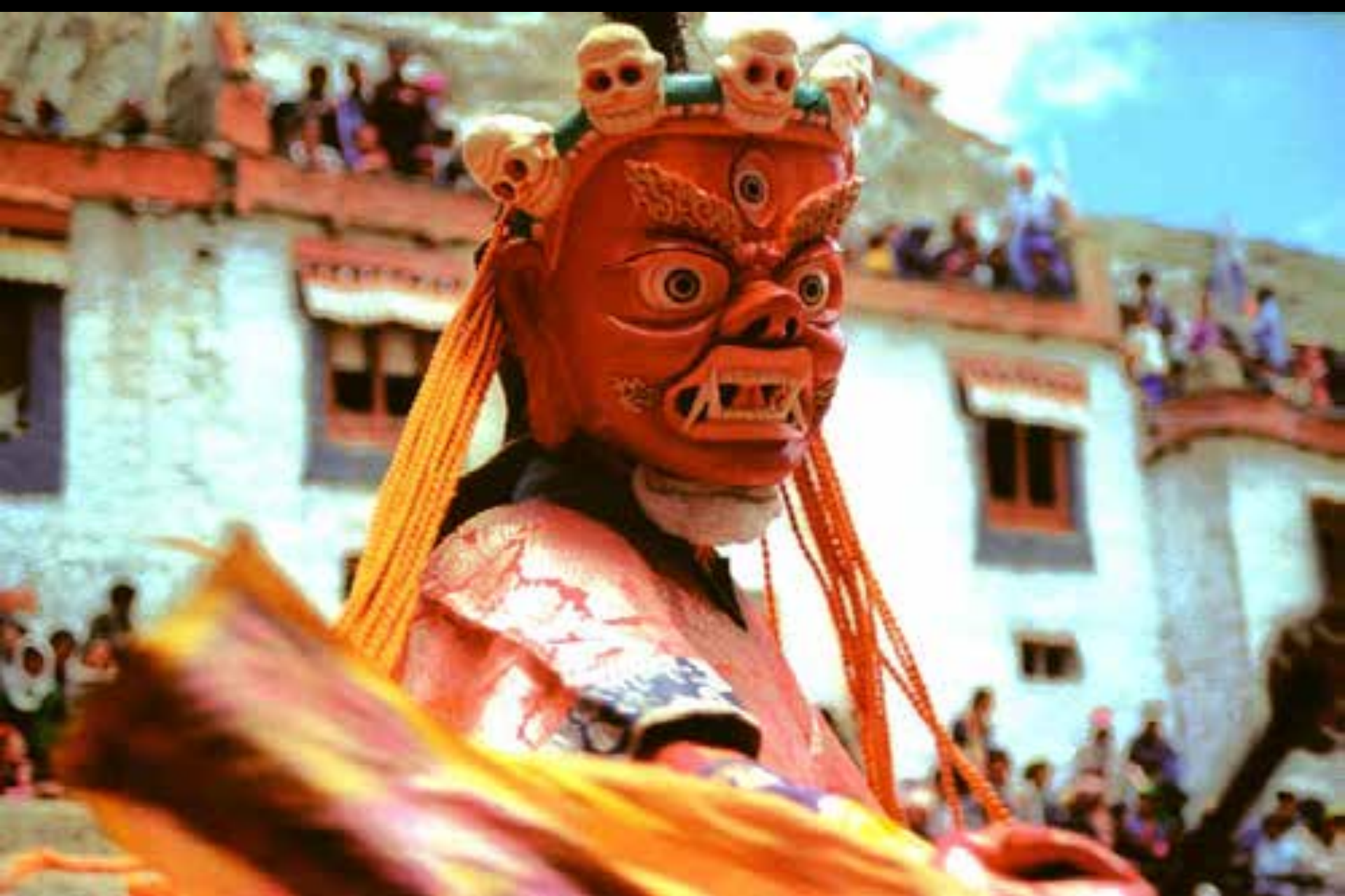
Cham, Masked monastic dance of the Lamas, Ladakh, India.