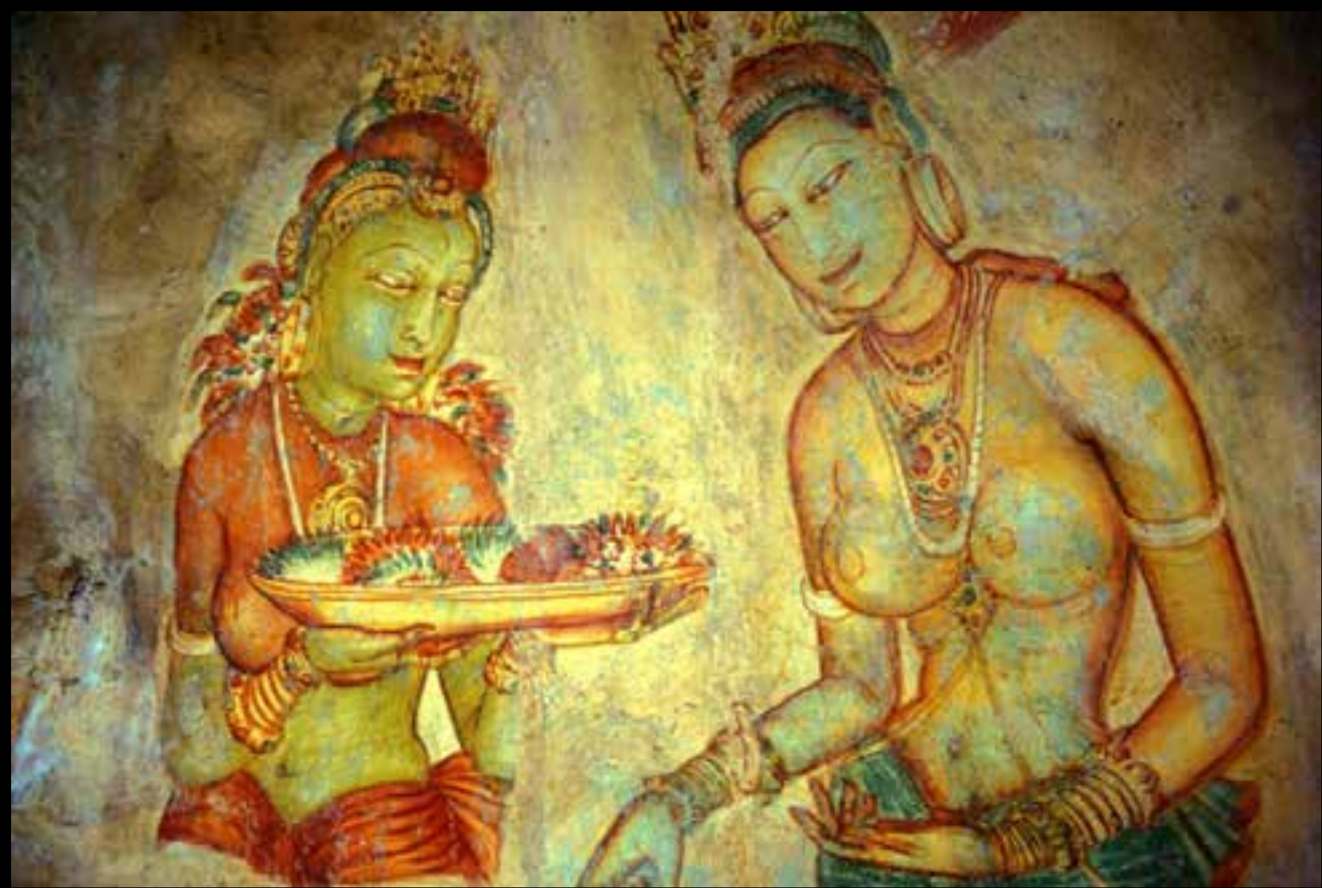
Apsaras, Mural, Sigiriya, c. 5th century, Sri Lanka.