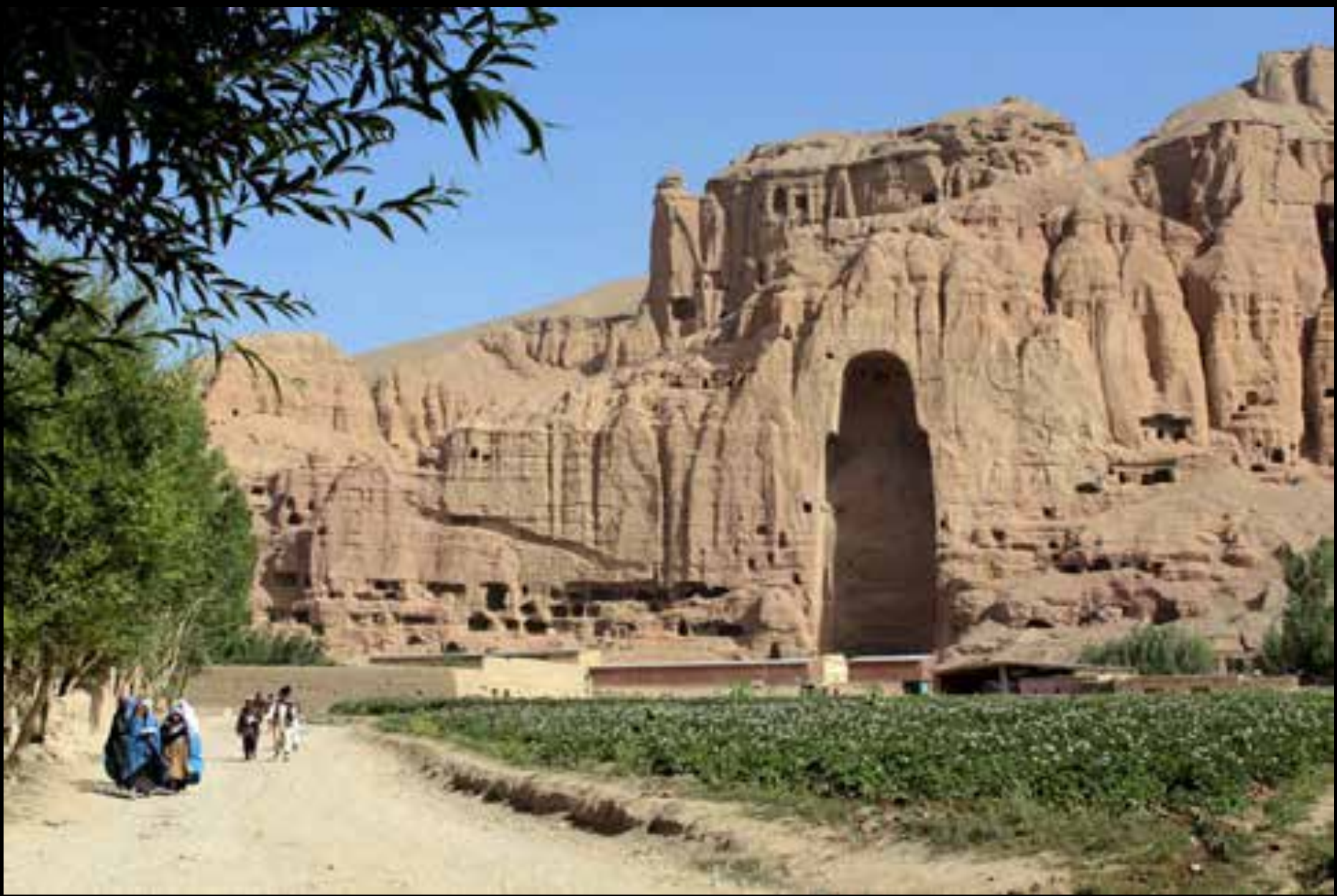
Bamiyan Site, Afghanistan.