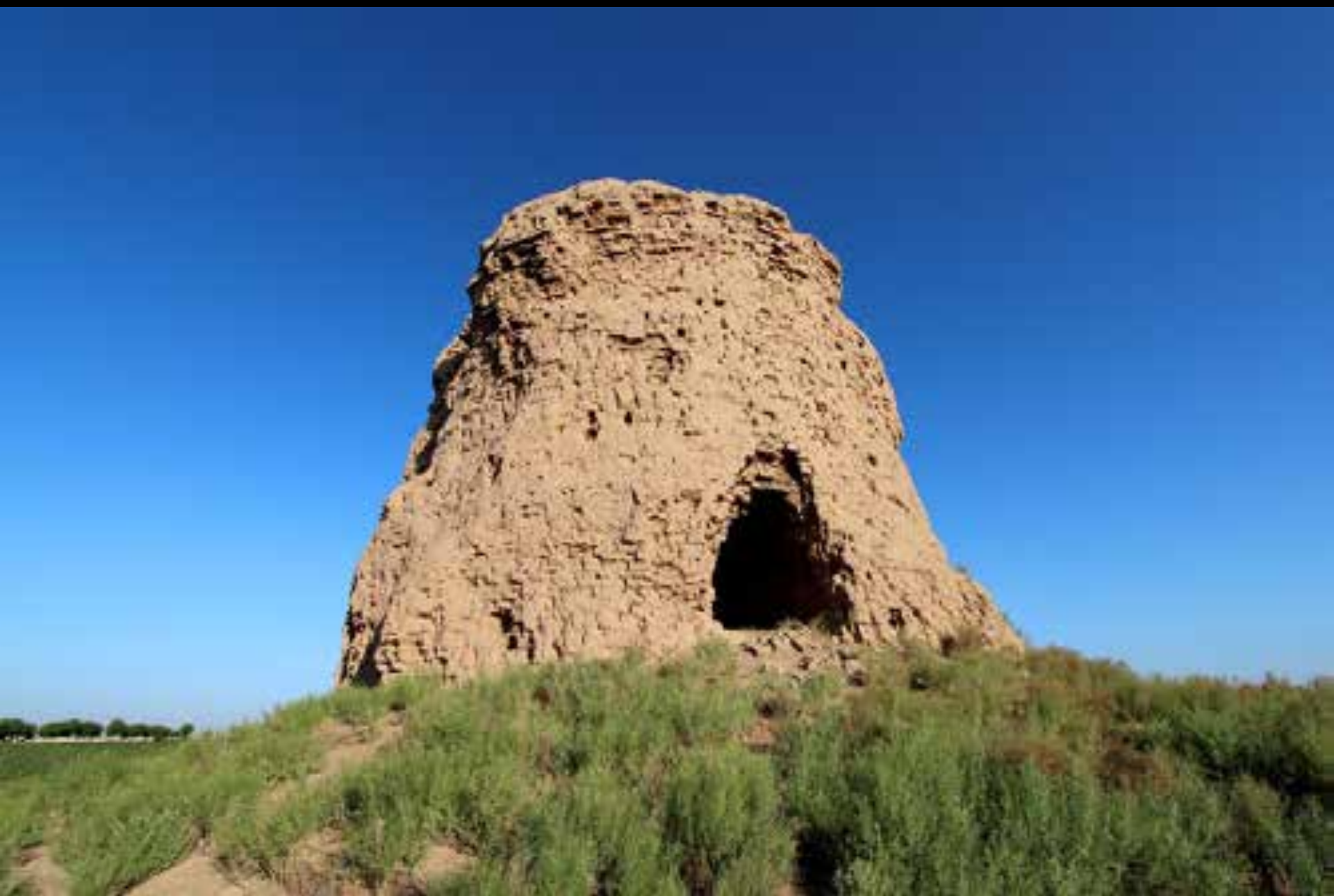
Buddhist Stupa at Zurmala, Termez, 3 rd century AD, Uzbekistan.