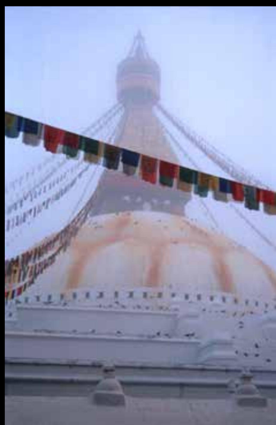
Bouddhanath Stupa, Kathmandu, Nepal.