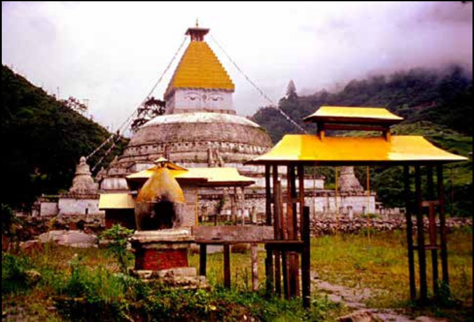
Gorsen Chorten, Tawang District, Arunachal Pradesh, 16th century AD, India.