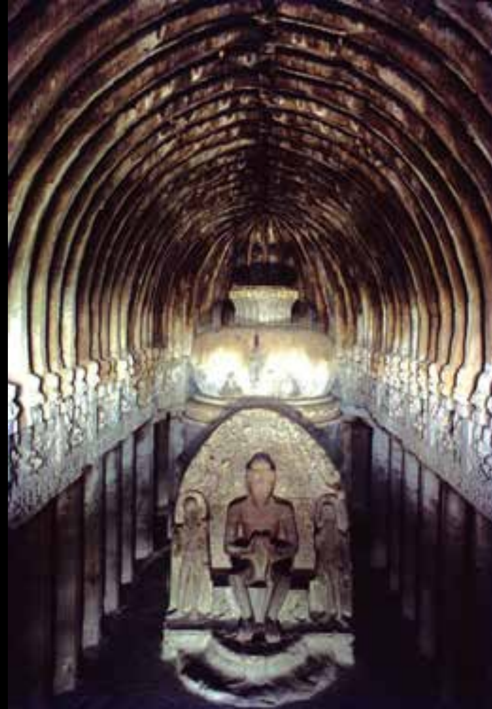
Chaitya- griha, c. 7 th century AD, Ellora, Maharashtra, India.