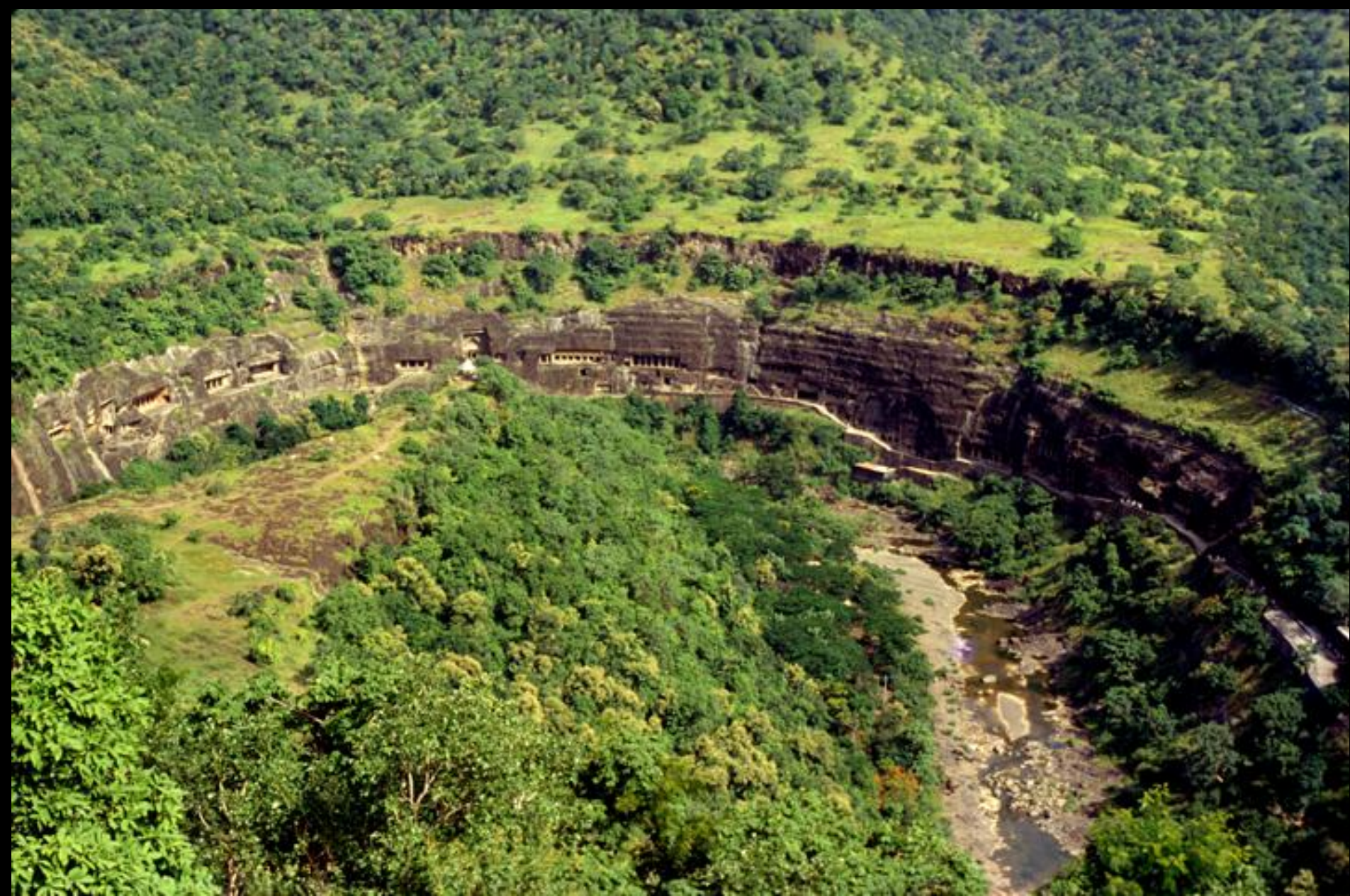
The Ajanta caves, 2 nd century BC to 6 th century AD, Maharashtra, India.