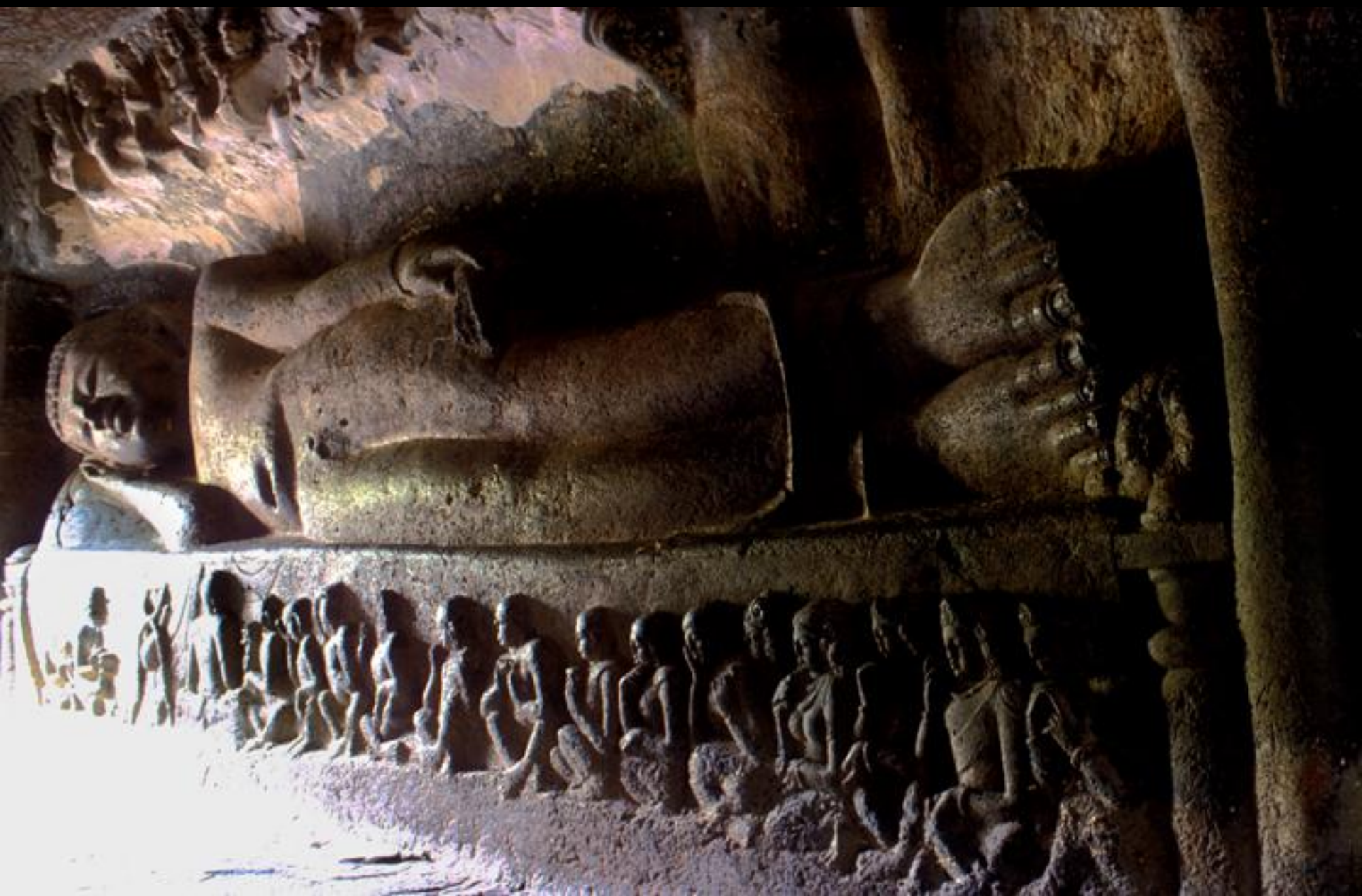
Mahaparinirvana, Cave 26, Ajanta, 6th century AD, India.