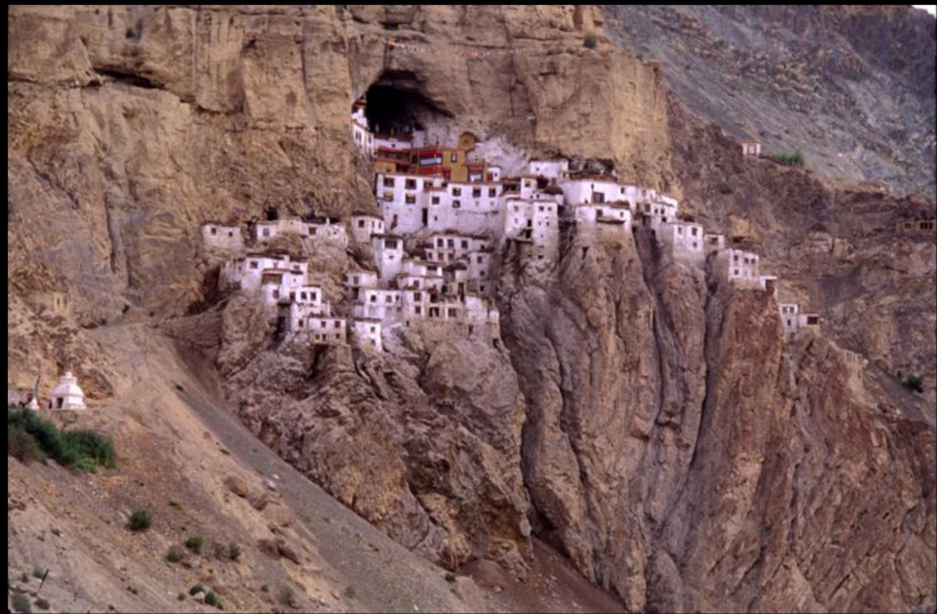
Phugtal Monastery, Zaskar, Ladakh, India. Photograph by Benoy K Behl