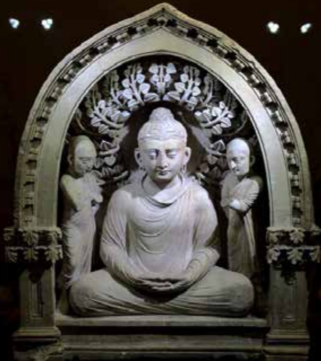
Buddha from Fayaz-Tepe, 1st-2nd century, Collection: Tashkent National Museum, Uzbekistan.