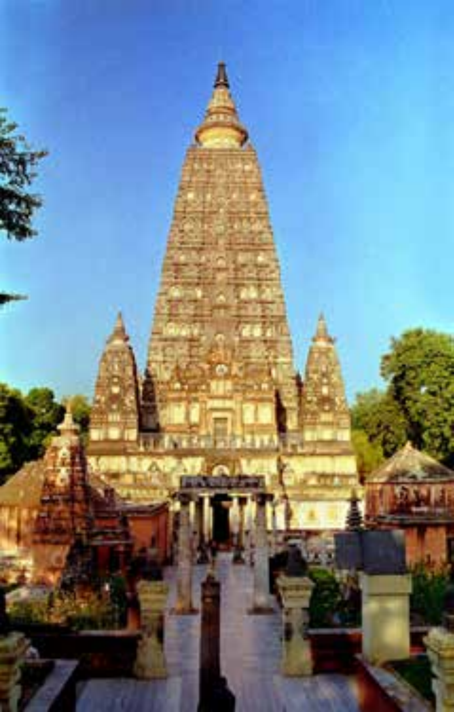
Mahabodhi Temple, Bodhgaya, Bihar, India.