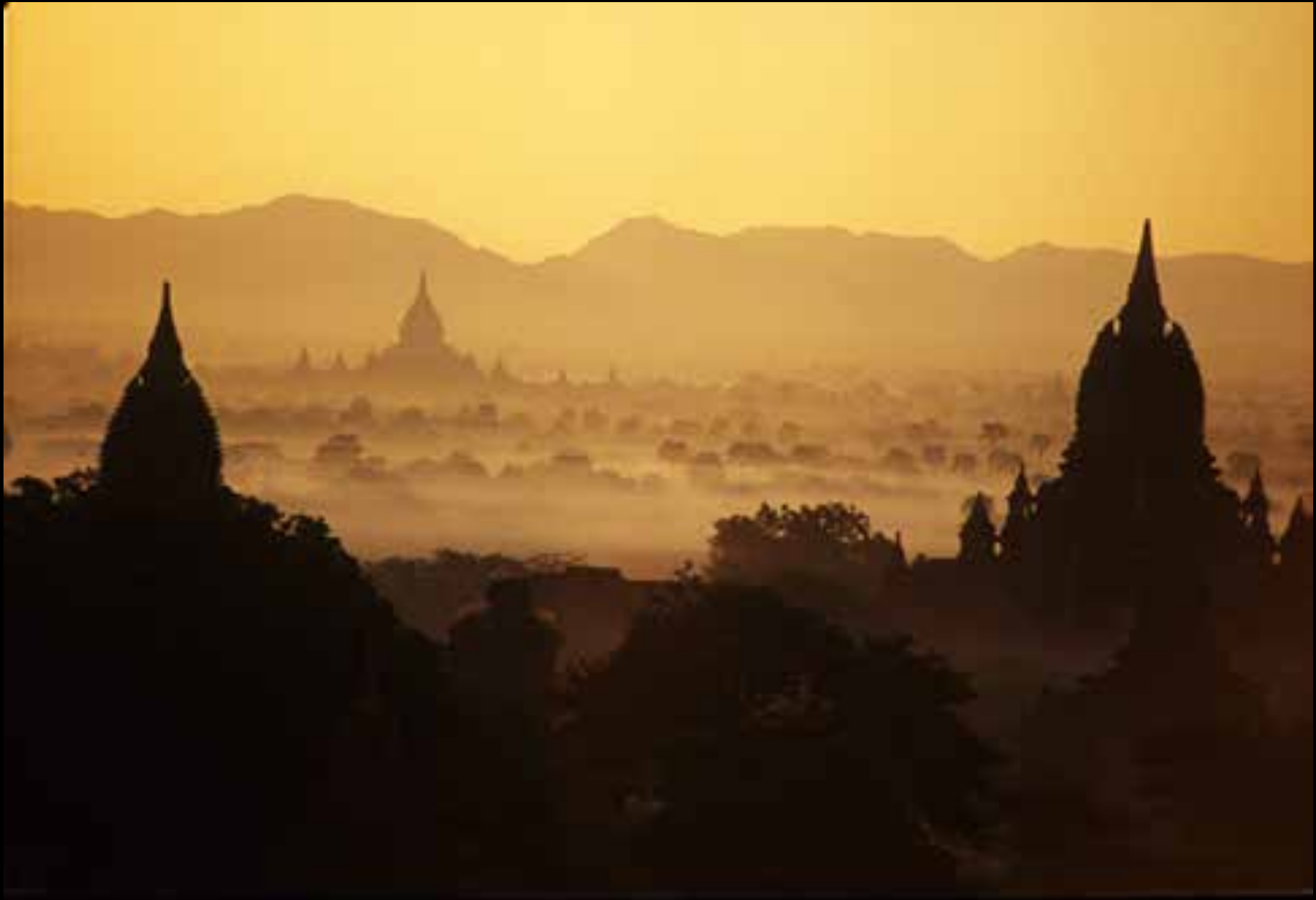
Pagodas at sunrise, Bagan, Myanmar.