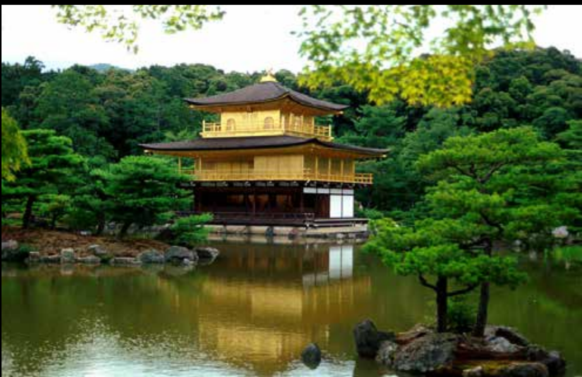
Kinkaku-ji Temple, Kyoto, 14th century AD, Japan.