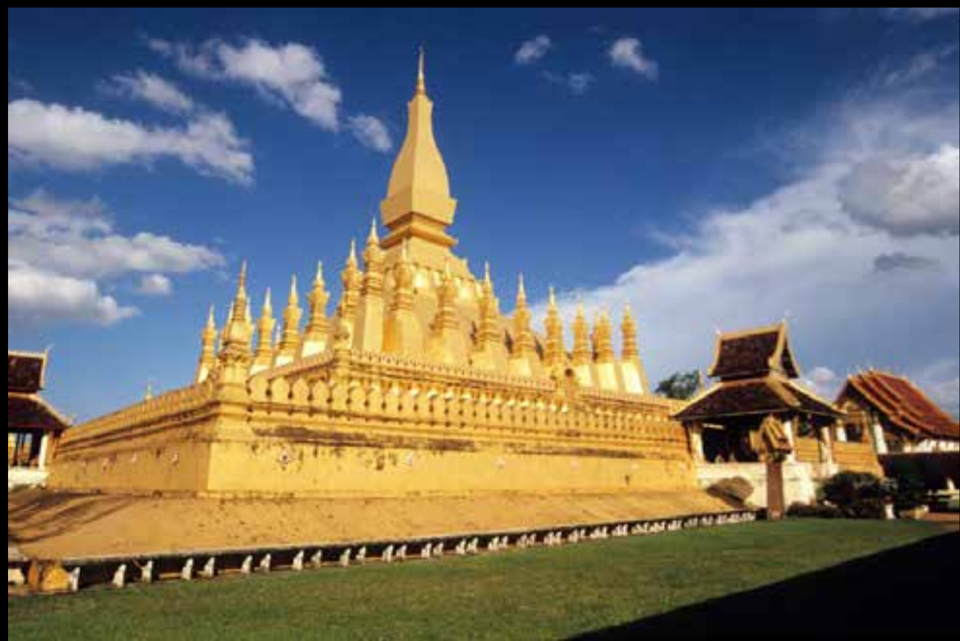
Vat That Luang, Vientiane, Laos.