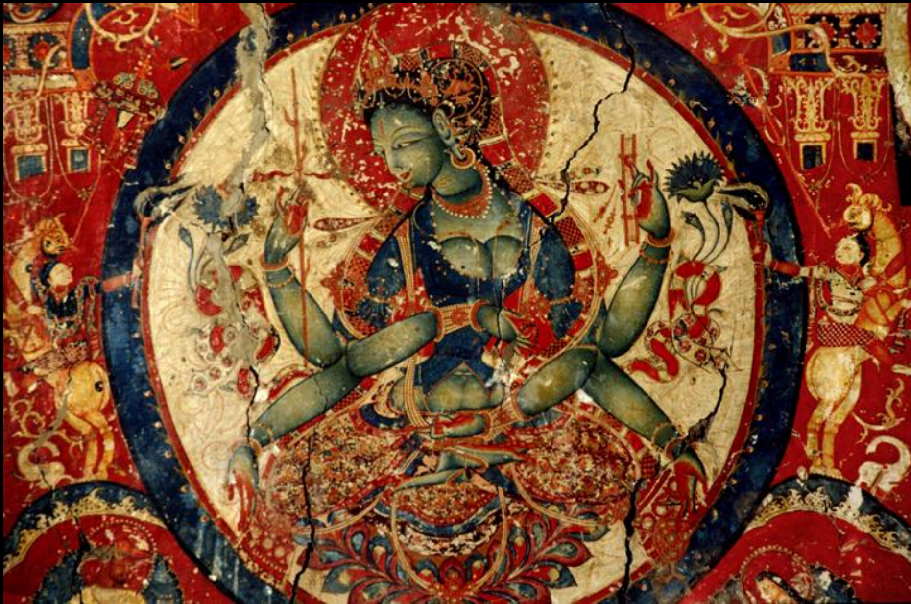
Green Tara, Mural, c.12 th century AD, Alchi Sumstek, Ladakh, India.