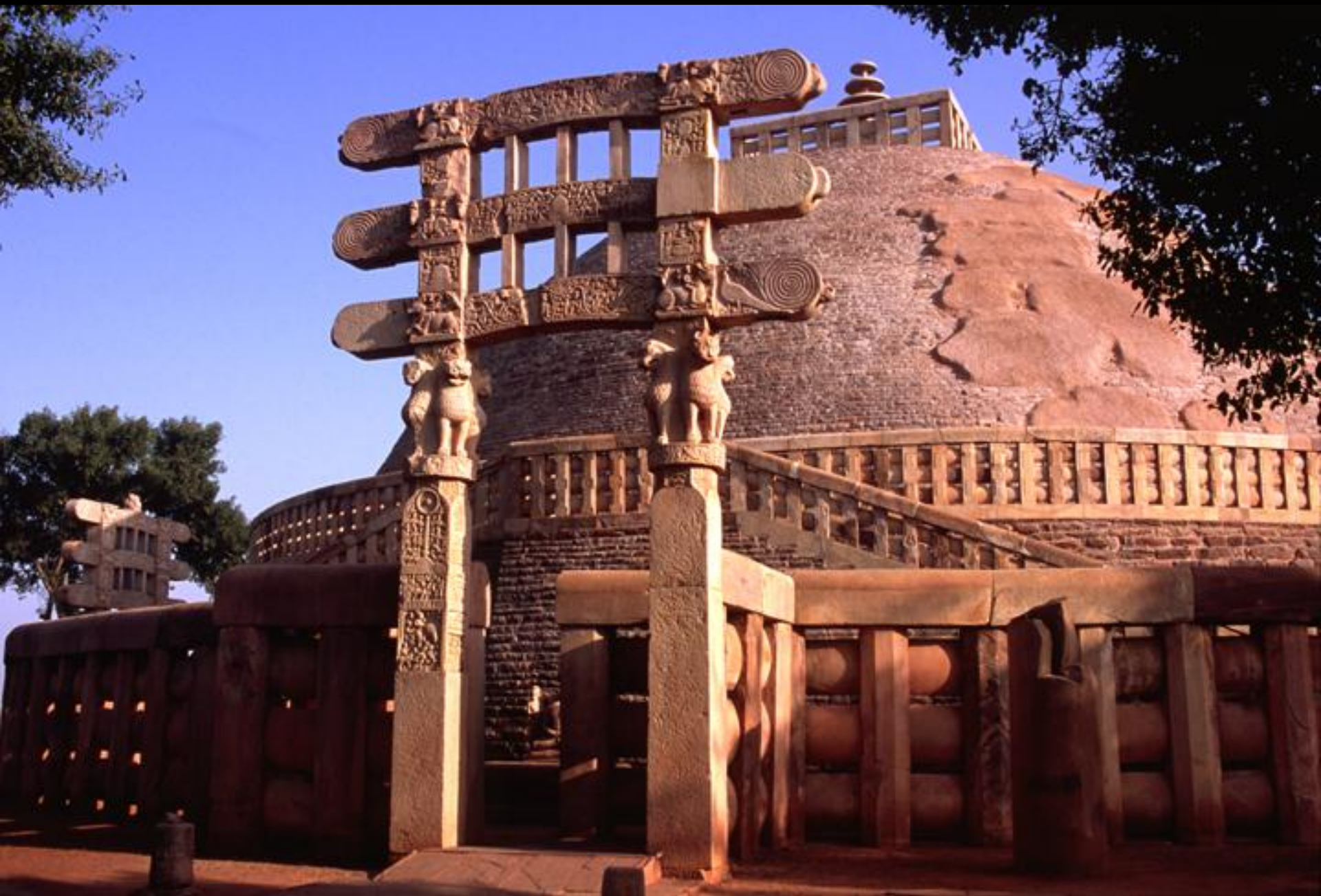
Great Stupa, Sanchi, Madhya Pradesh, India.