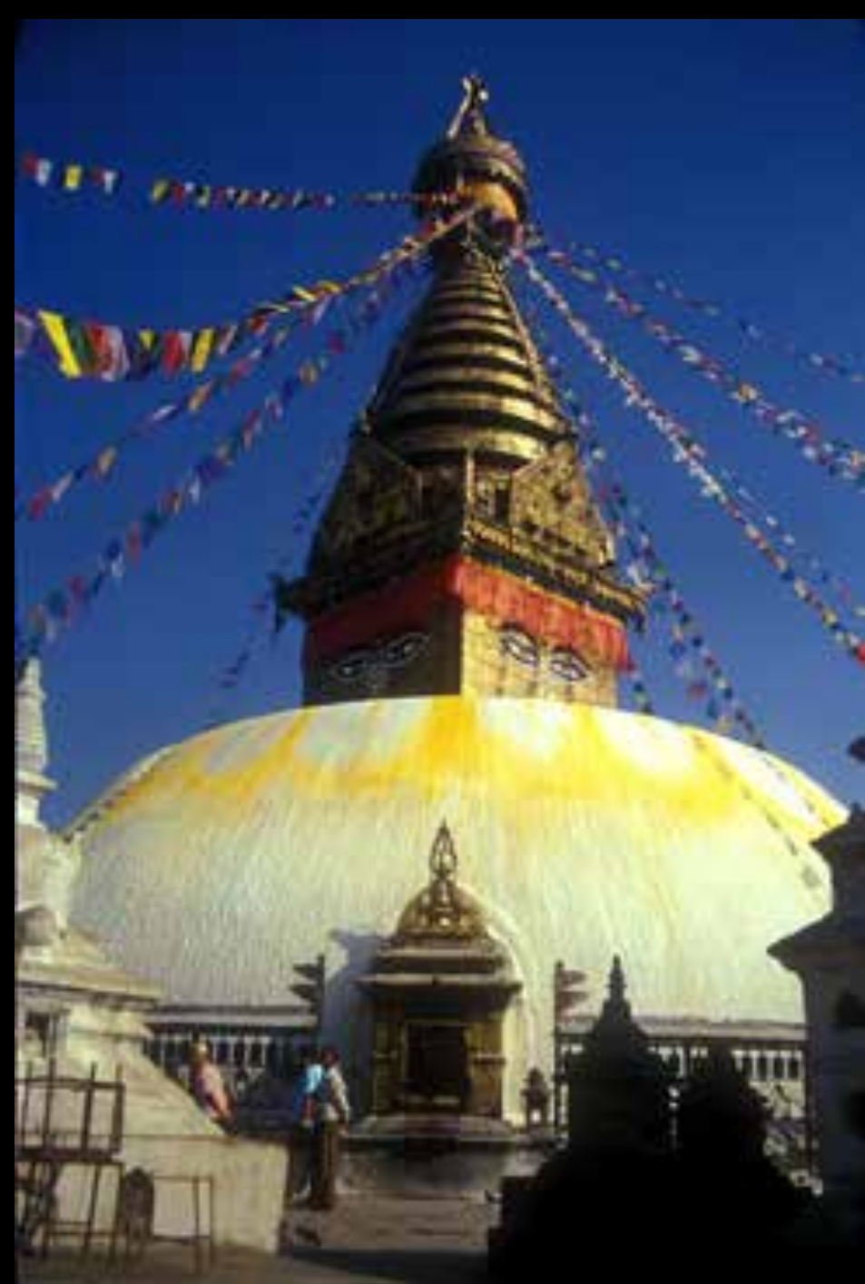
Swayambhunath Stupa, Kathmandu, Nepal.