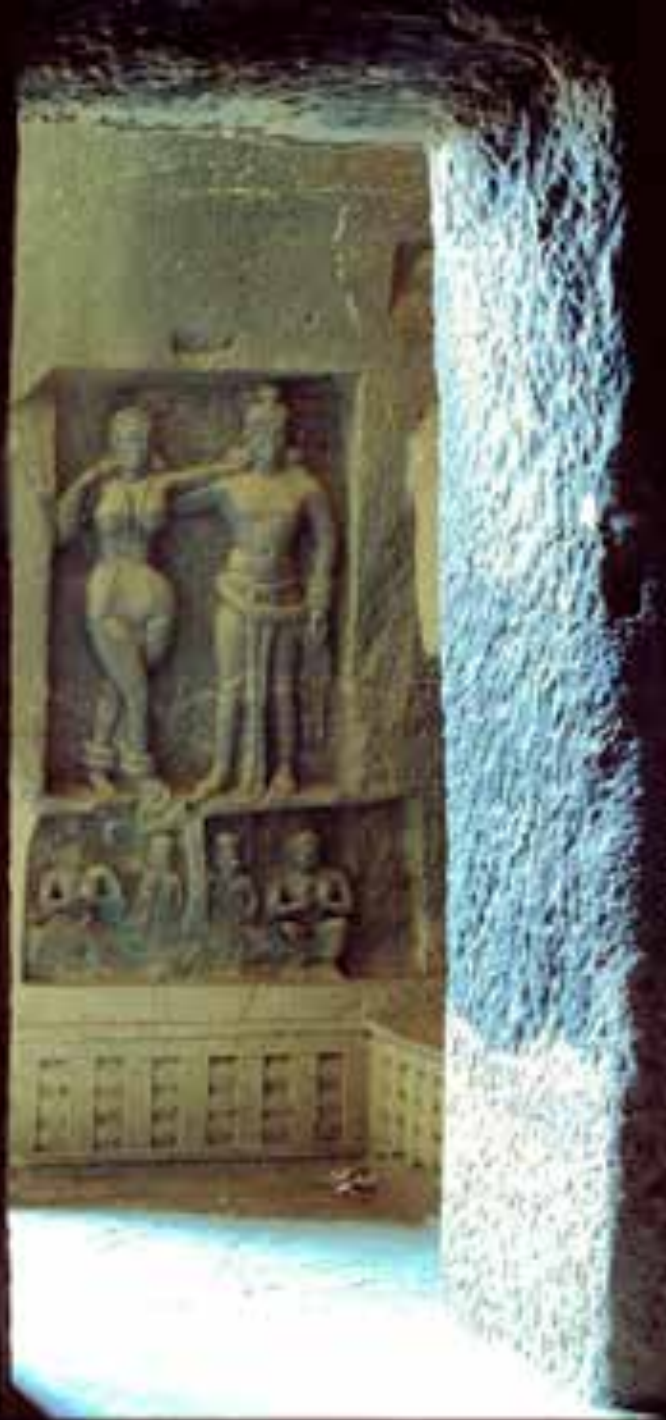
Mithunas, chaitya- griha, Karle 1st – 2nd century AD, Maharashtra, India.