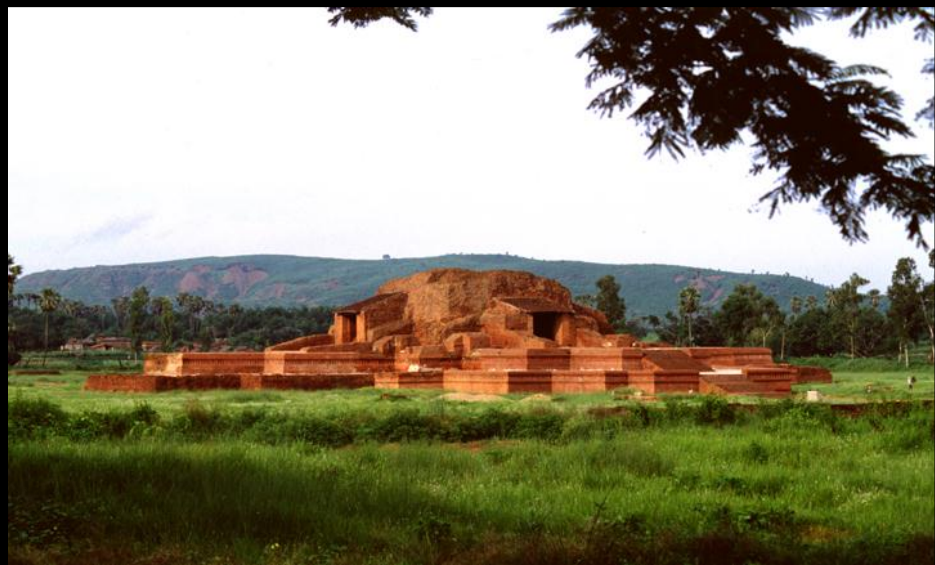
Stupa, Vikramshila University site, 12 th century Bihar, India.