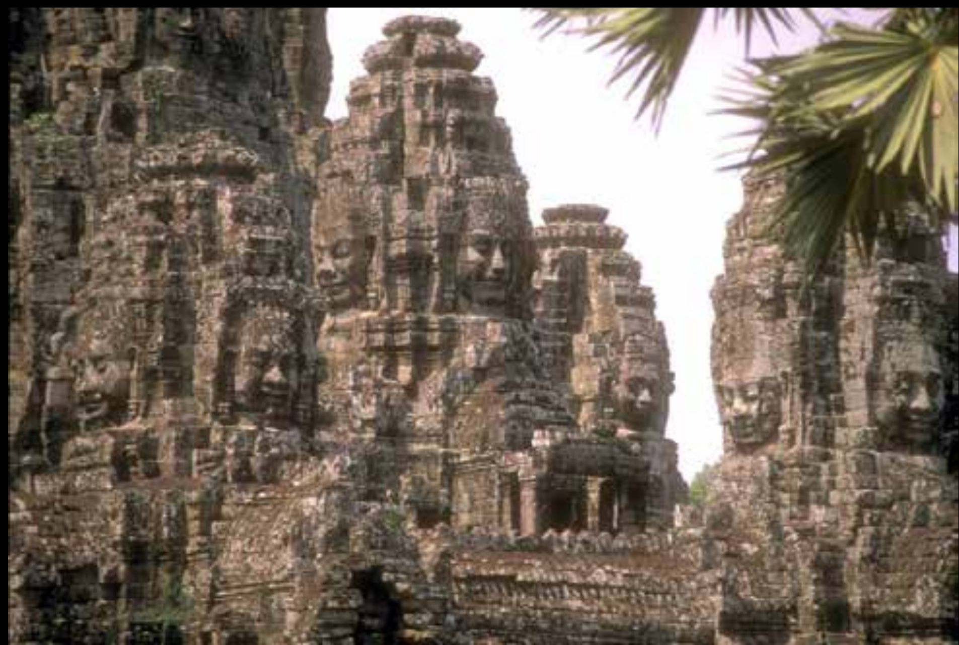
Bayon, 13 th century, Cambodia.