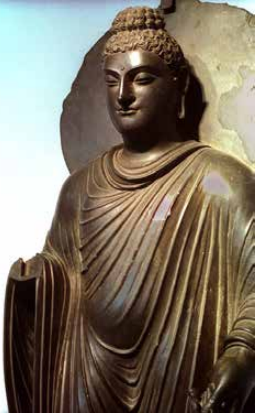
Buddha, Sculpture, Gandhara, Indian subcontinent.