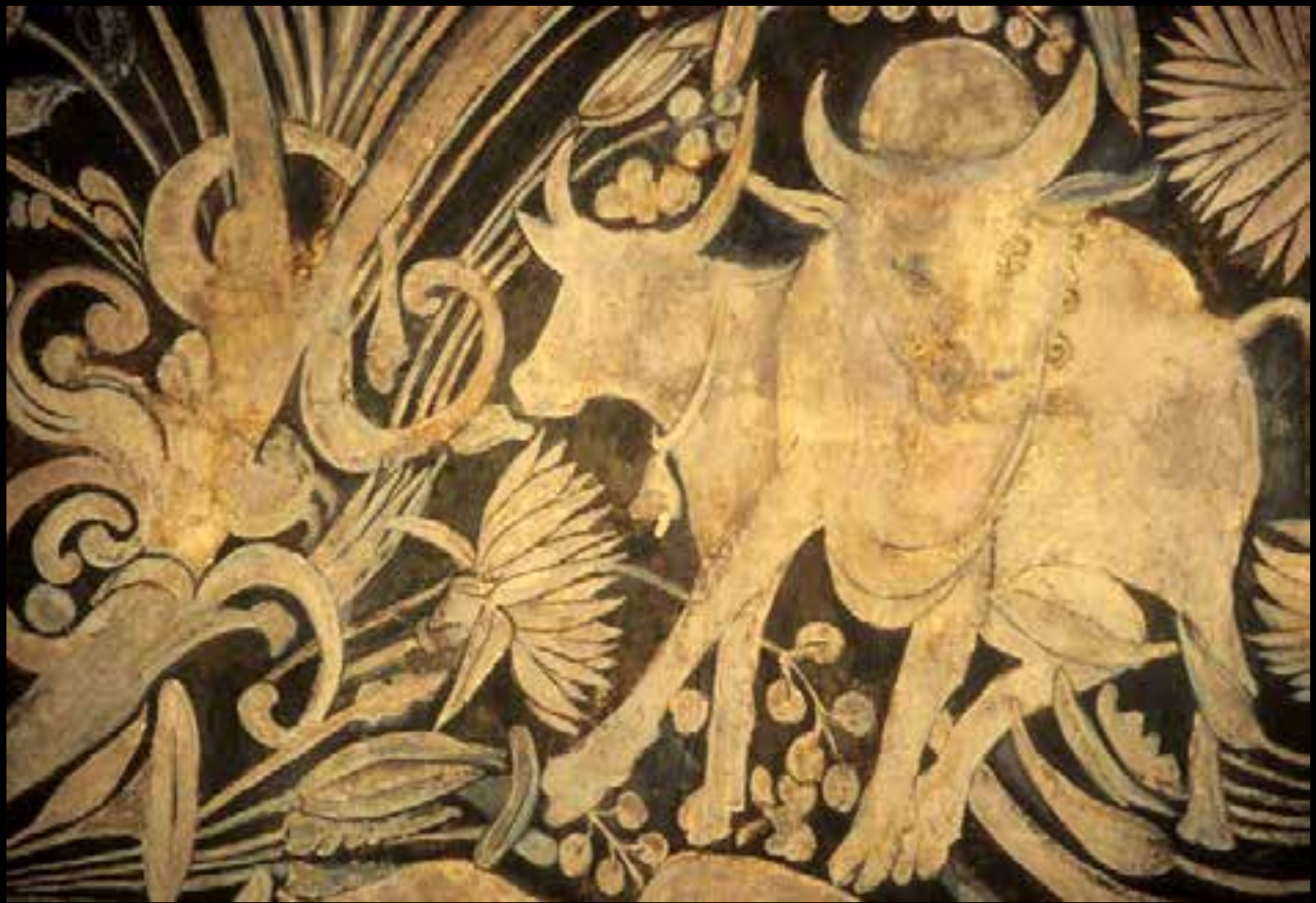
Bulls, Mural, Bagh Caves, Madhya Pradesh, India.