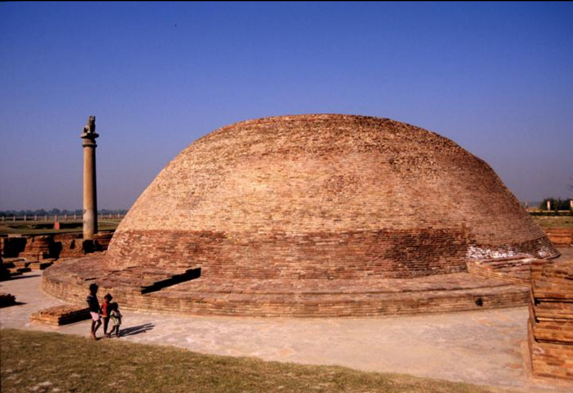
Stupa and Ashoka Pillar, Vaishali, Bihar, India.