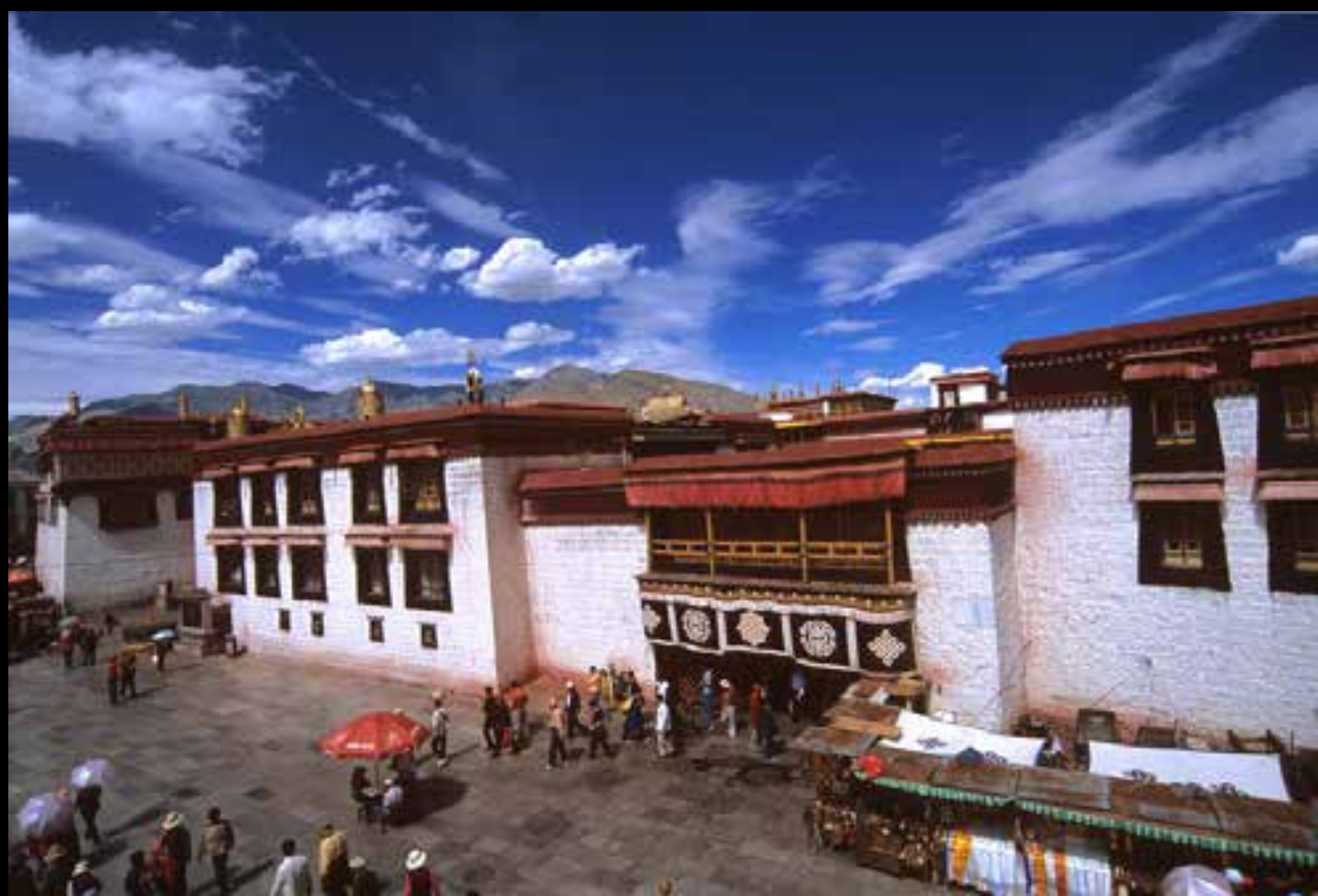
Jokhang Temple, Lhasa, founded in the 7 th century, Tibet.