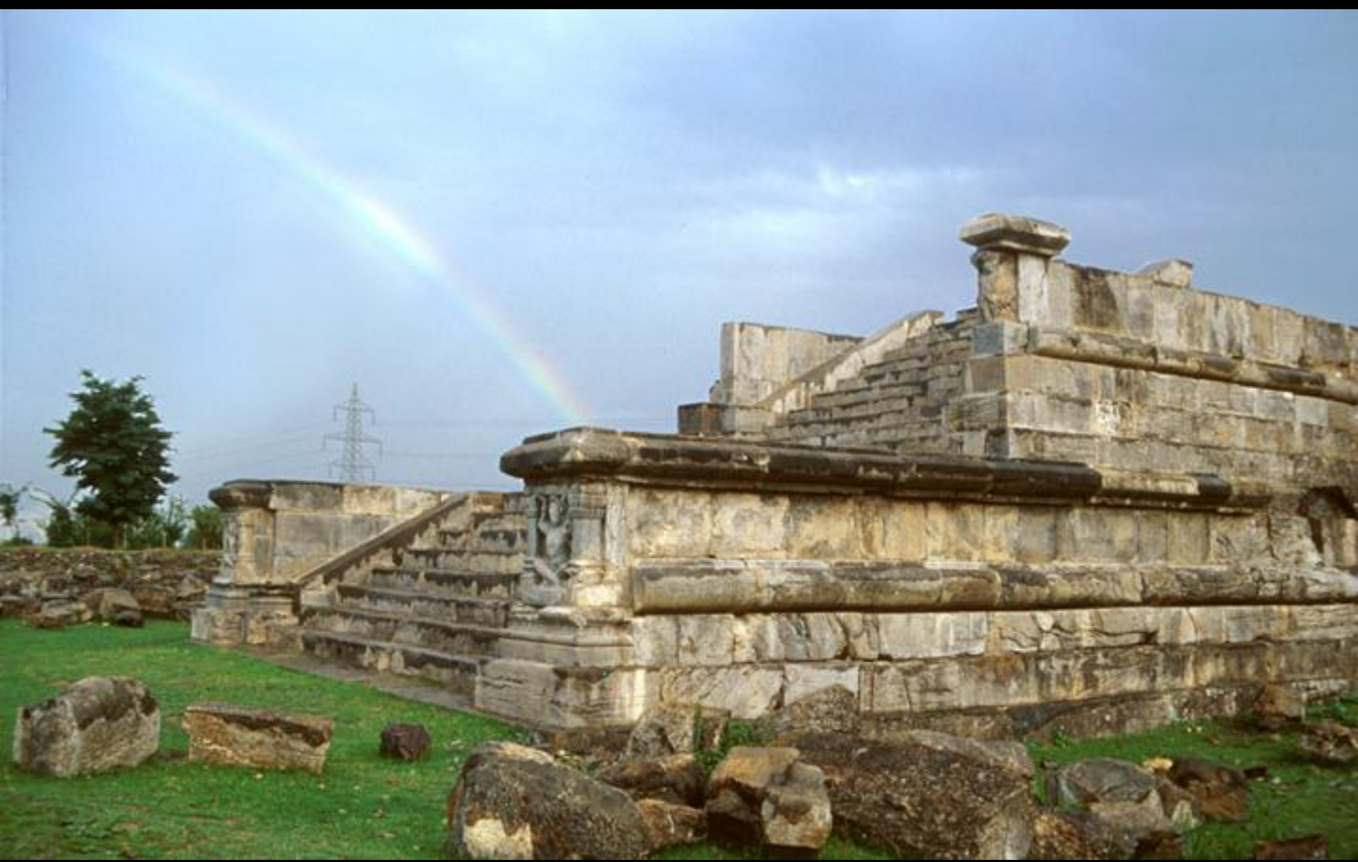
Remains of Monastery, 8th century AD, Parihaspura, Kashmir, India.