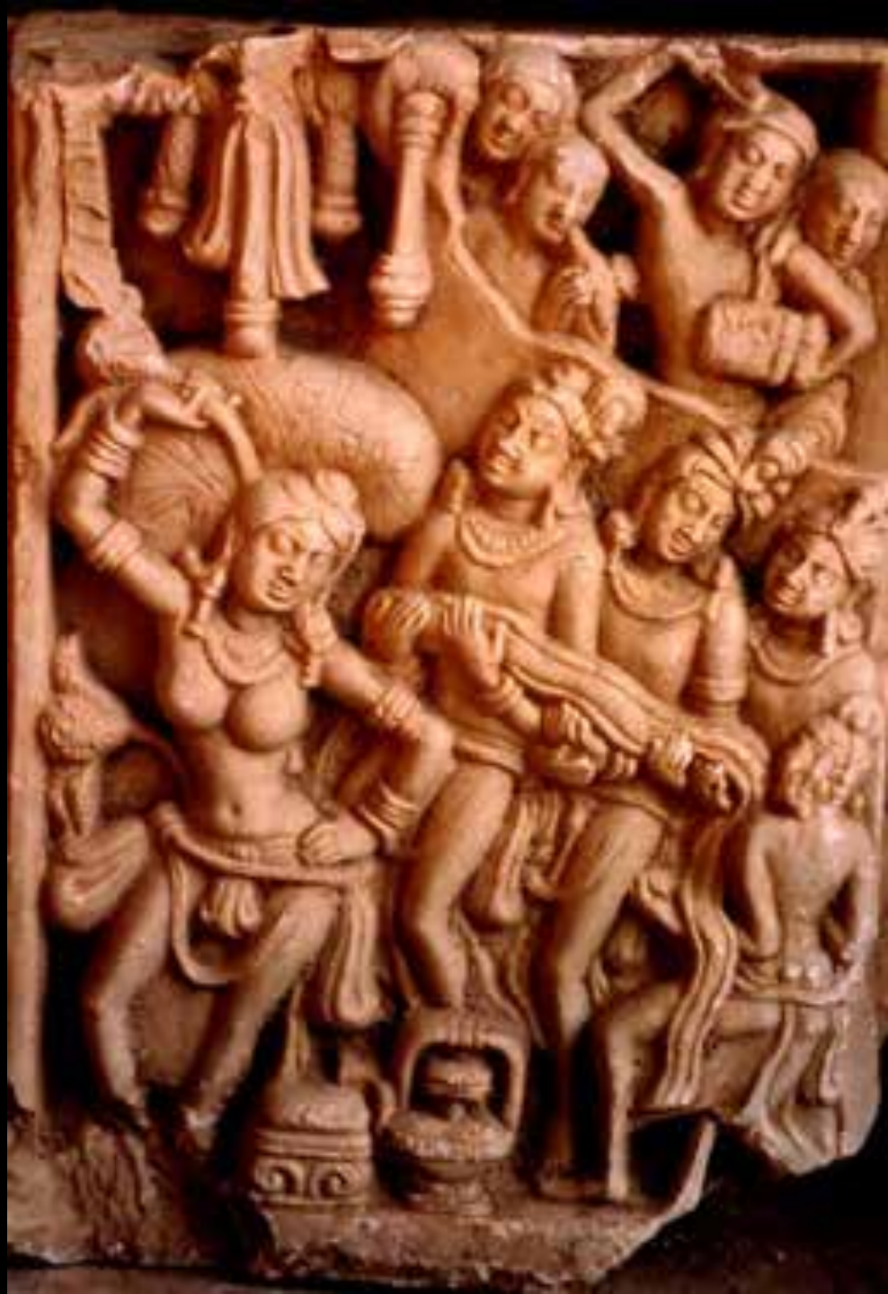
Birth of the Buddha, recently discovered sculptural panel, 1st century AD, Panigiri, Andhra Pradesh, India.