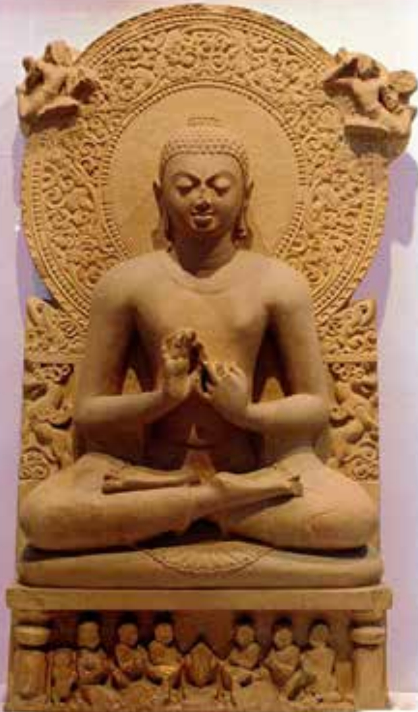
Buddha in dharmachakrapravartana mudra , Sarnath, Uttar Pradesh, 5th century AD, India.