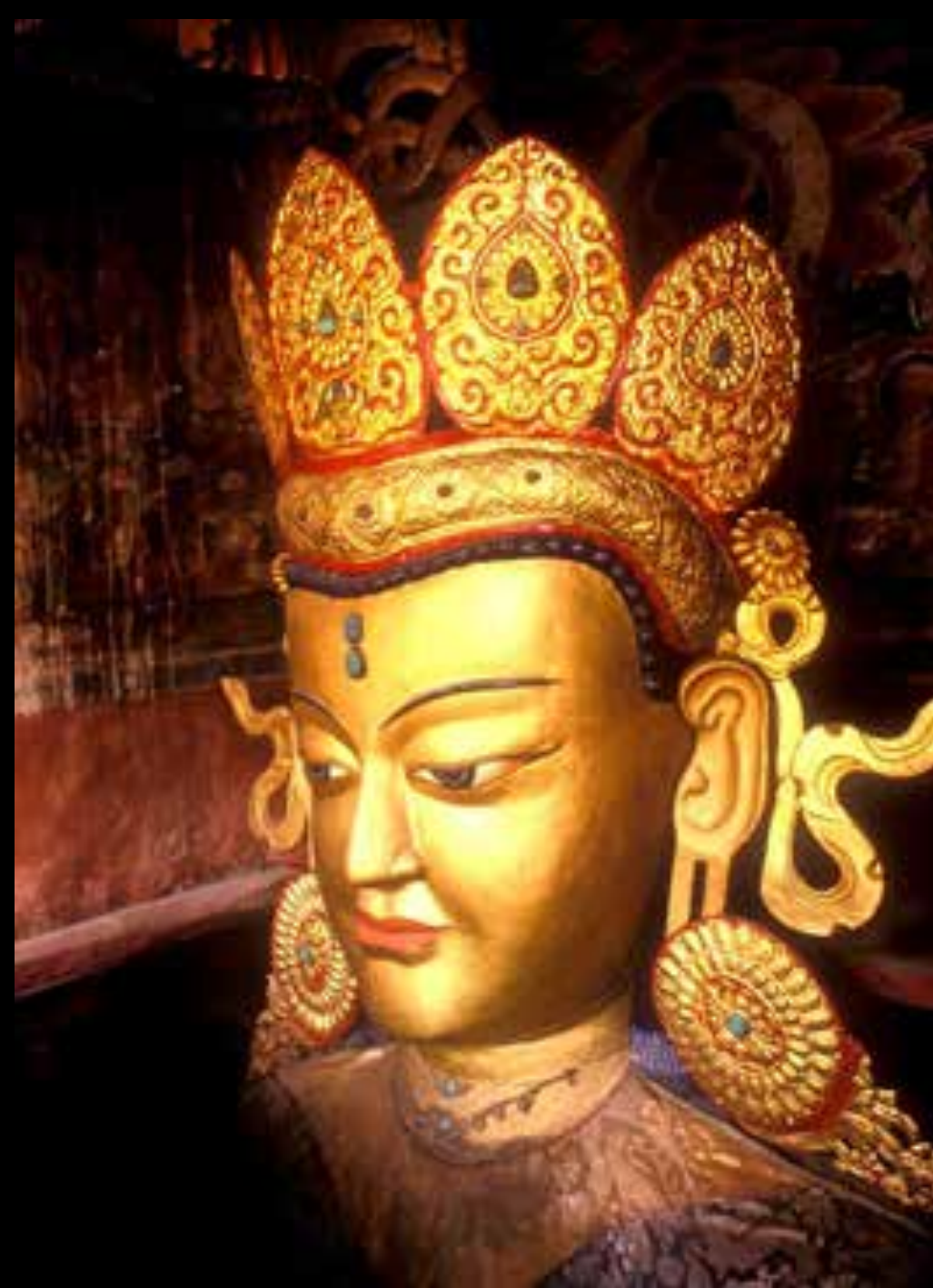
Maitreya, Basgo, 16 th / 17 th century, Ladakh, India. Photograph by Benoy K Behl