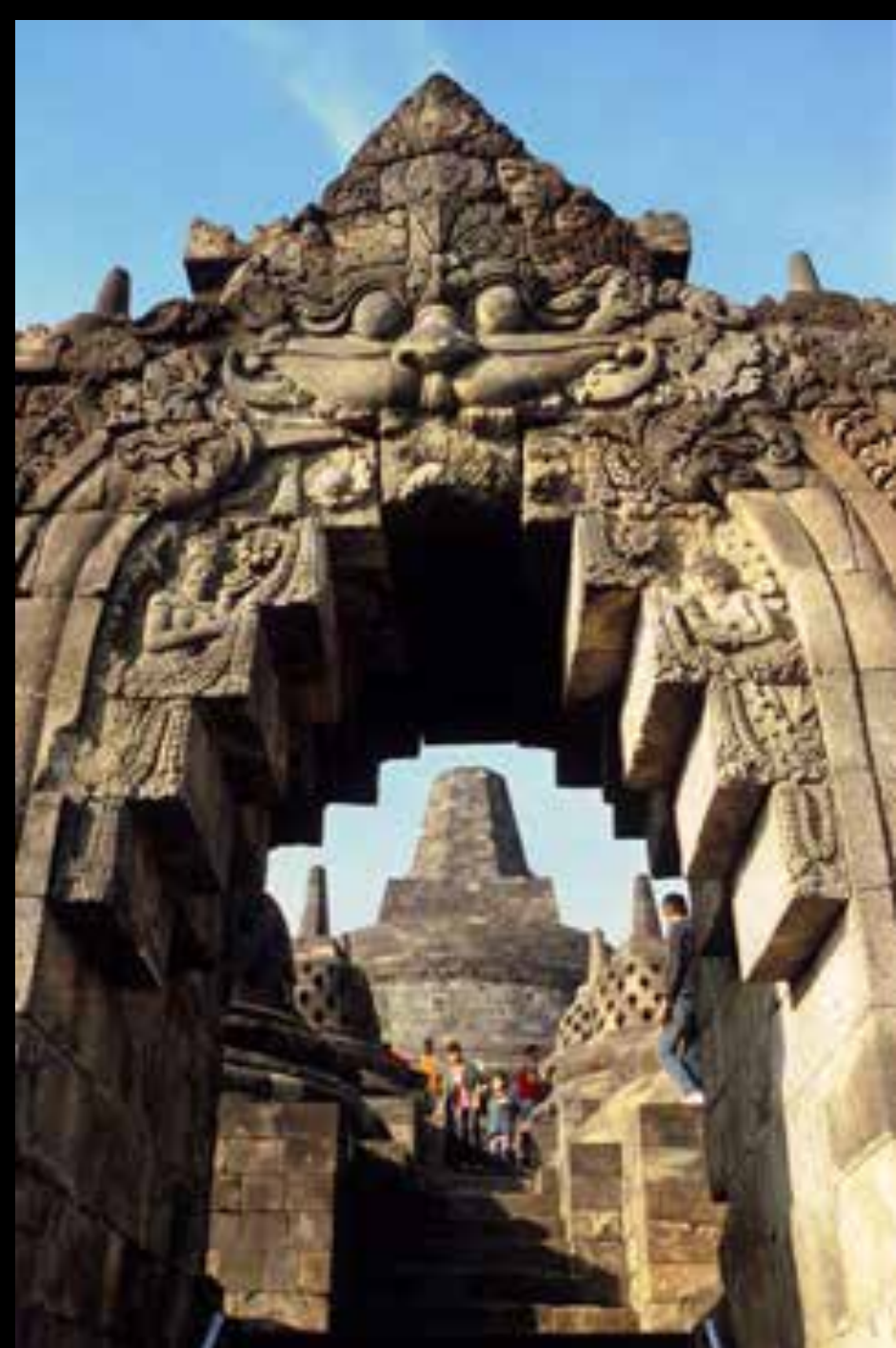
Kala Gateway, near the top of the Borobudur Stupa, Java, Indonesia.