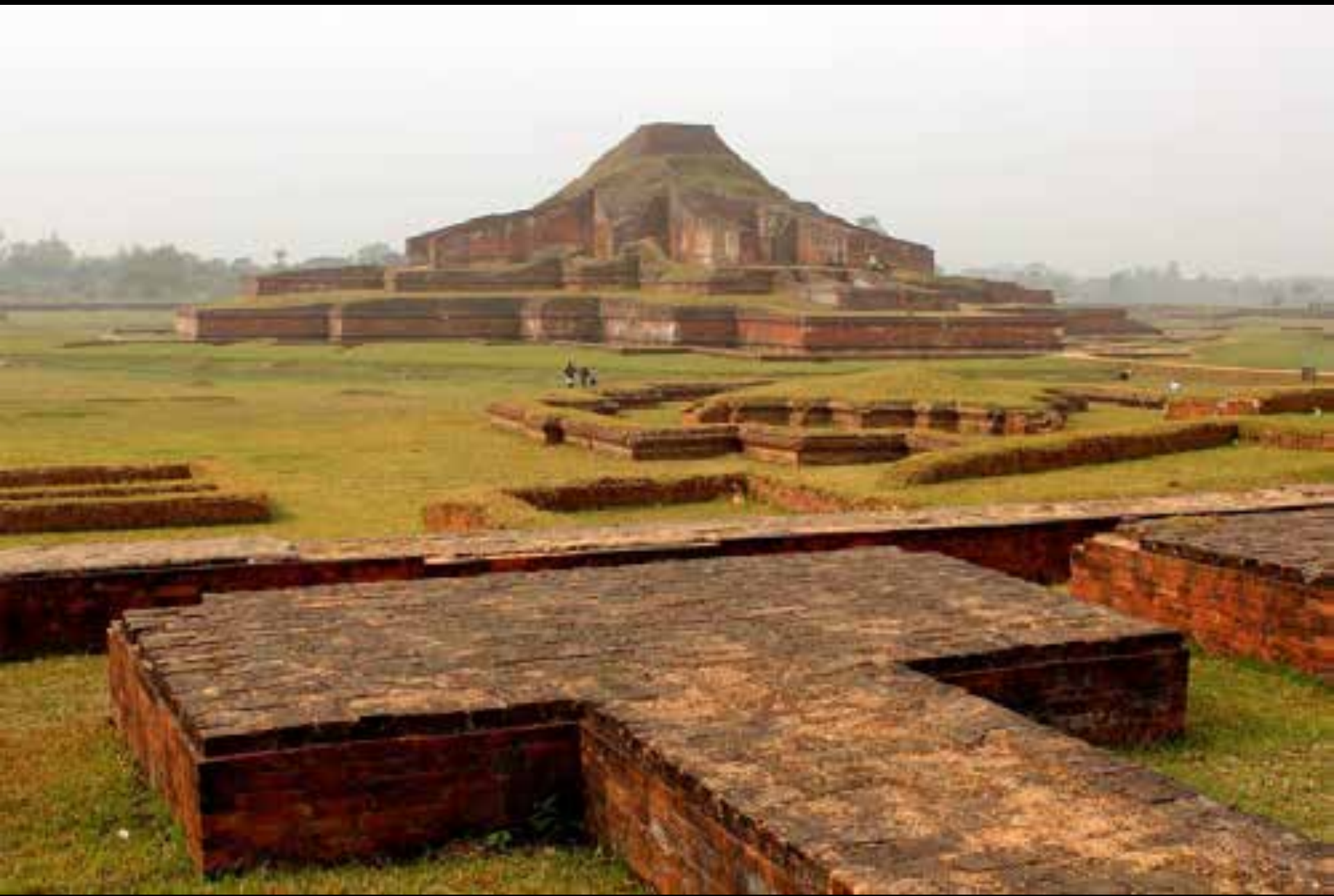
Somapura Vihara, Paharpur site, Naogaon, Bangladesh.