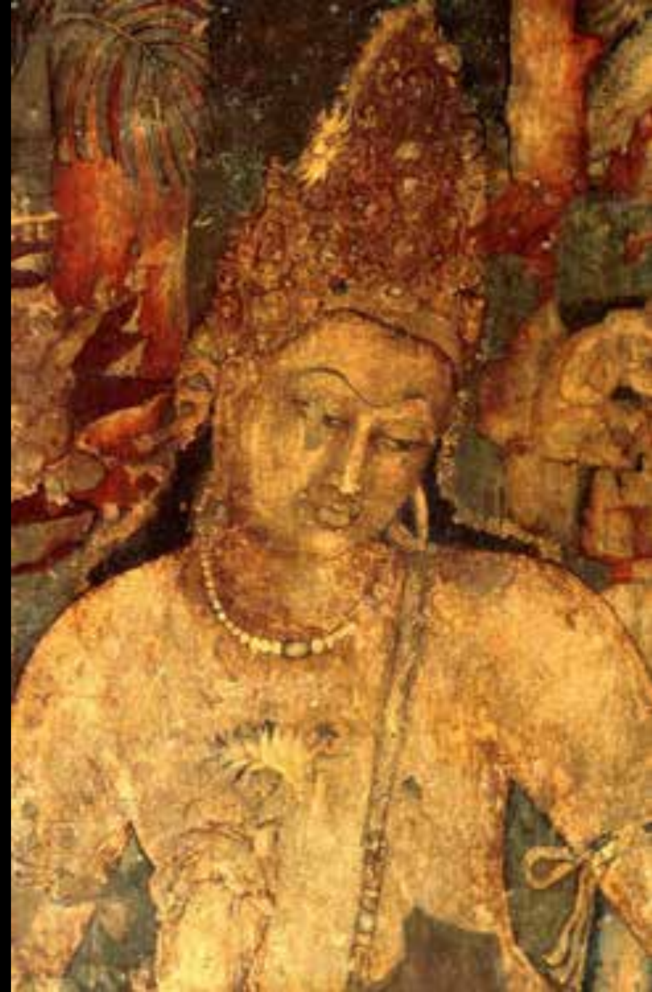
Bodhisattva Padmapani, Mural, 5 th century AD, Cave 1, Ajanta, Maharashtra, India.