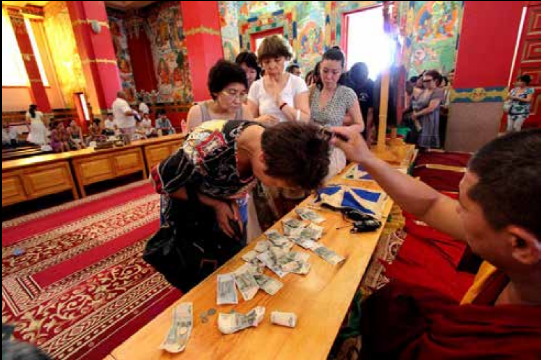
People of Kalmykia receiving blessings of a Ladakhi lama, Elista, Russia.