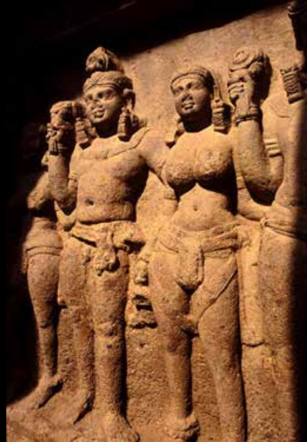
Mithuna couple, chaitya- griha, 2 nd century AD, Kanheri, Maharashtra, India.