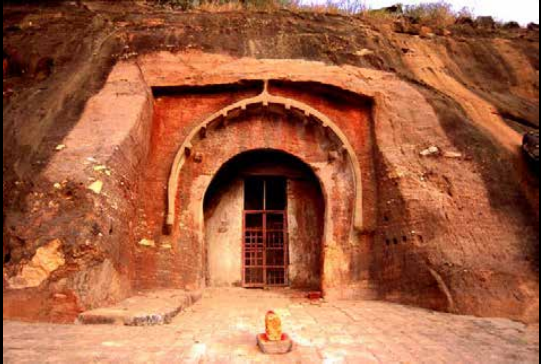
Cave 1, Guntupalli, Andhra Pradesh, India.