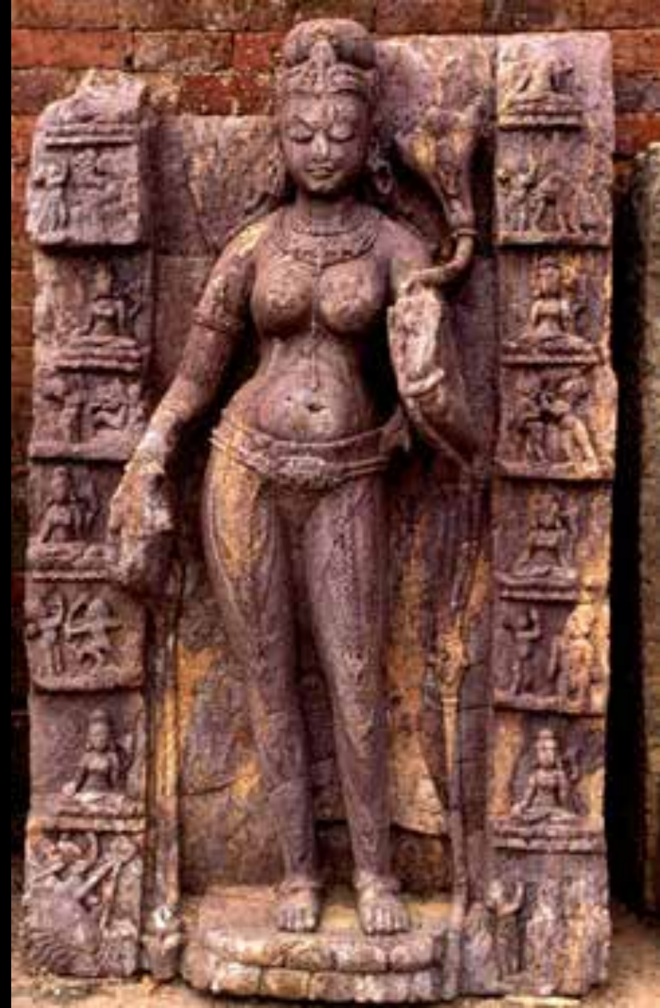
Tara, sculpture, Ratnagiri, Orissa, India.