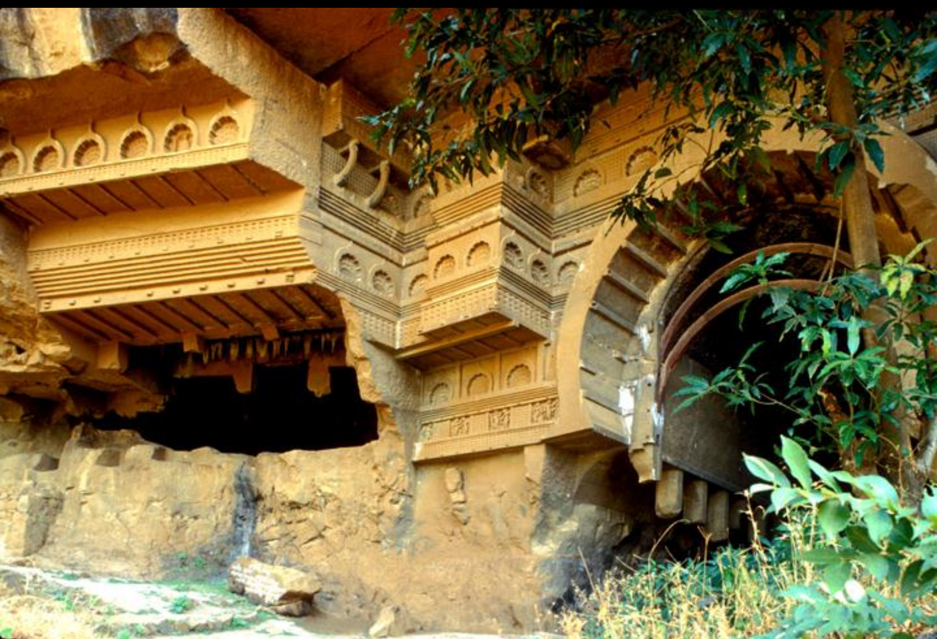
Chaitya-griha, Kondawane, Maharashtra, India.