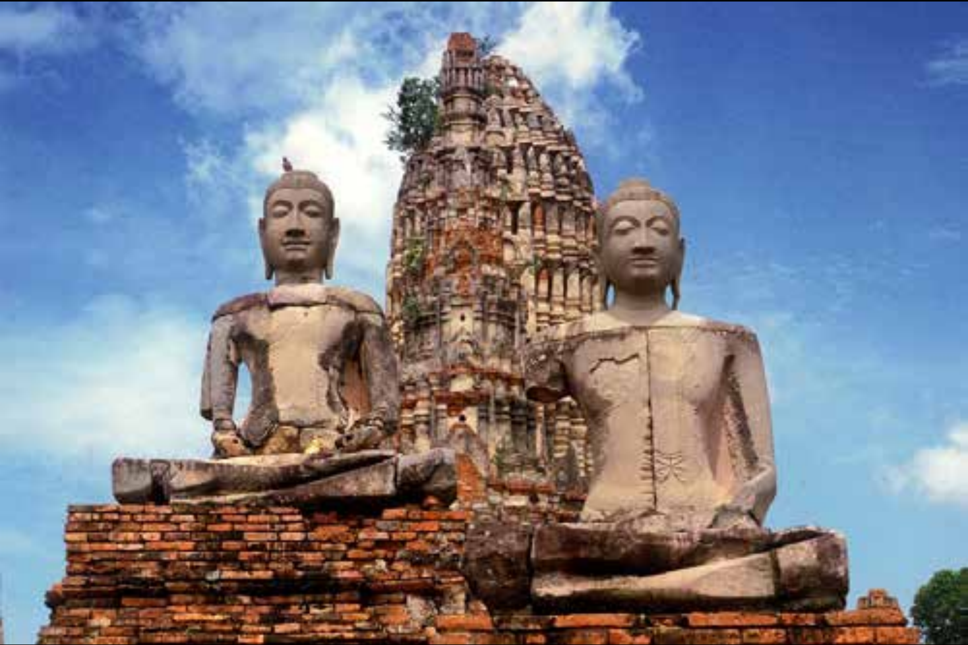
Seated Buddhas, Wat Chawattanaram, 17 th century, Ayutthaya, Thailand.