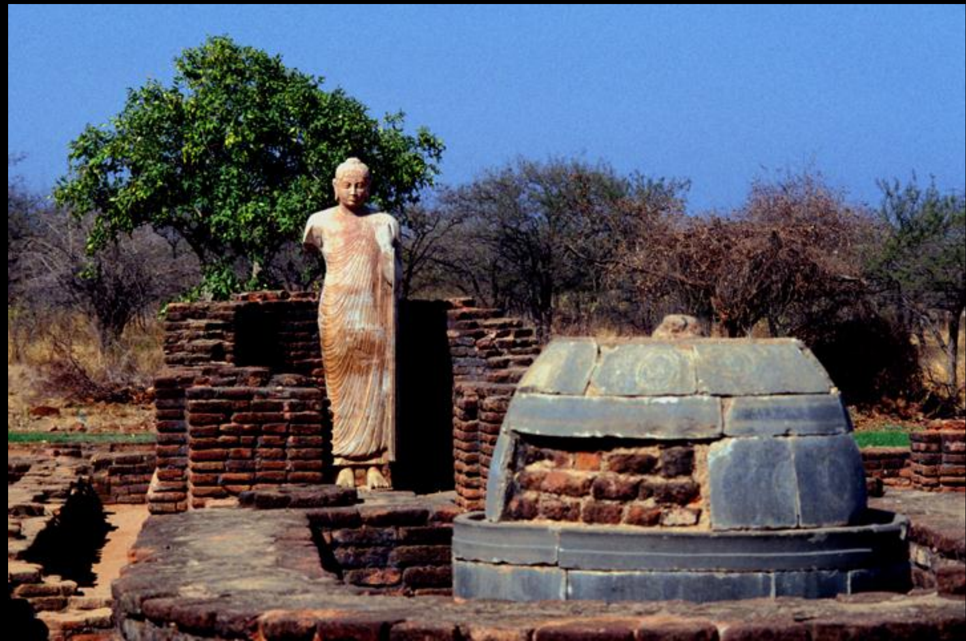
Buddha Sculpture and Stupa, 3 rd / 4 th centuries AD, Andhra Pradesh, India.