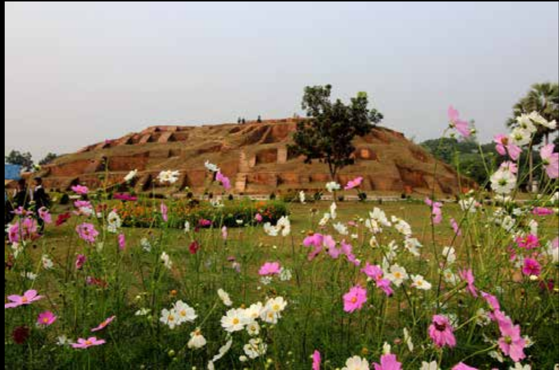
Gokul Medh, Mahasthangarh site, Bangladesh.