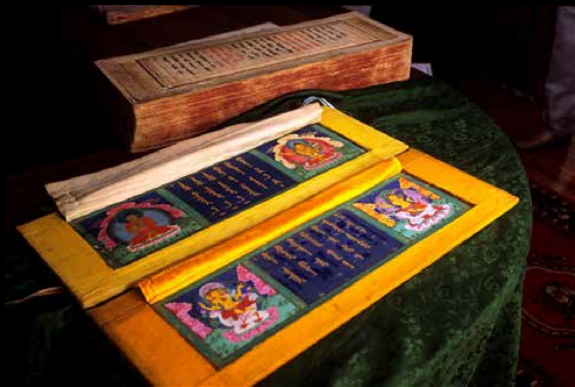
Mongolian Ganjur, sacred Buddhist text, 18th century, Ulan Ude, Buryatia, Russia.