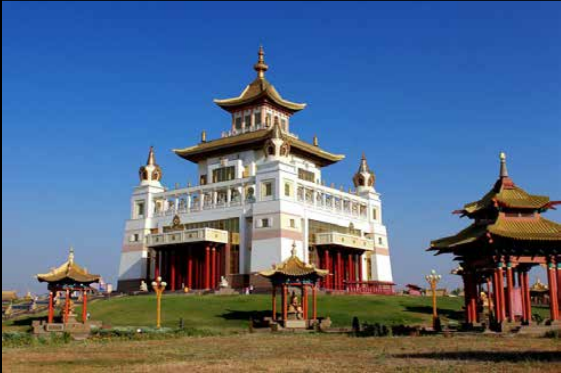
Golden Abode of Shakiyamuni Temple, Kalmykia, Russia.