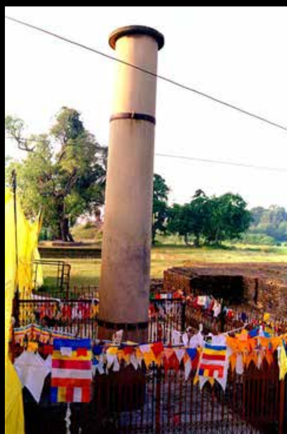
Ashoka Pillar, Lumbini, Nepal.